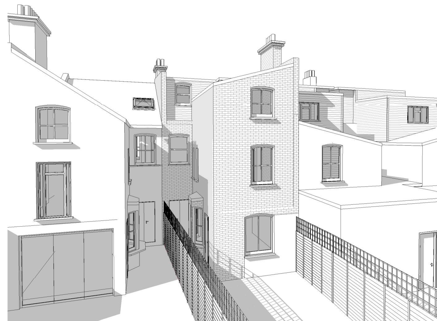
3D View 1_Proposed