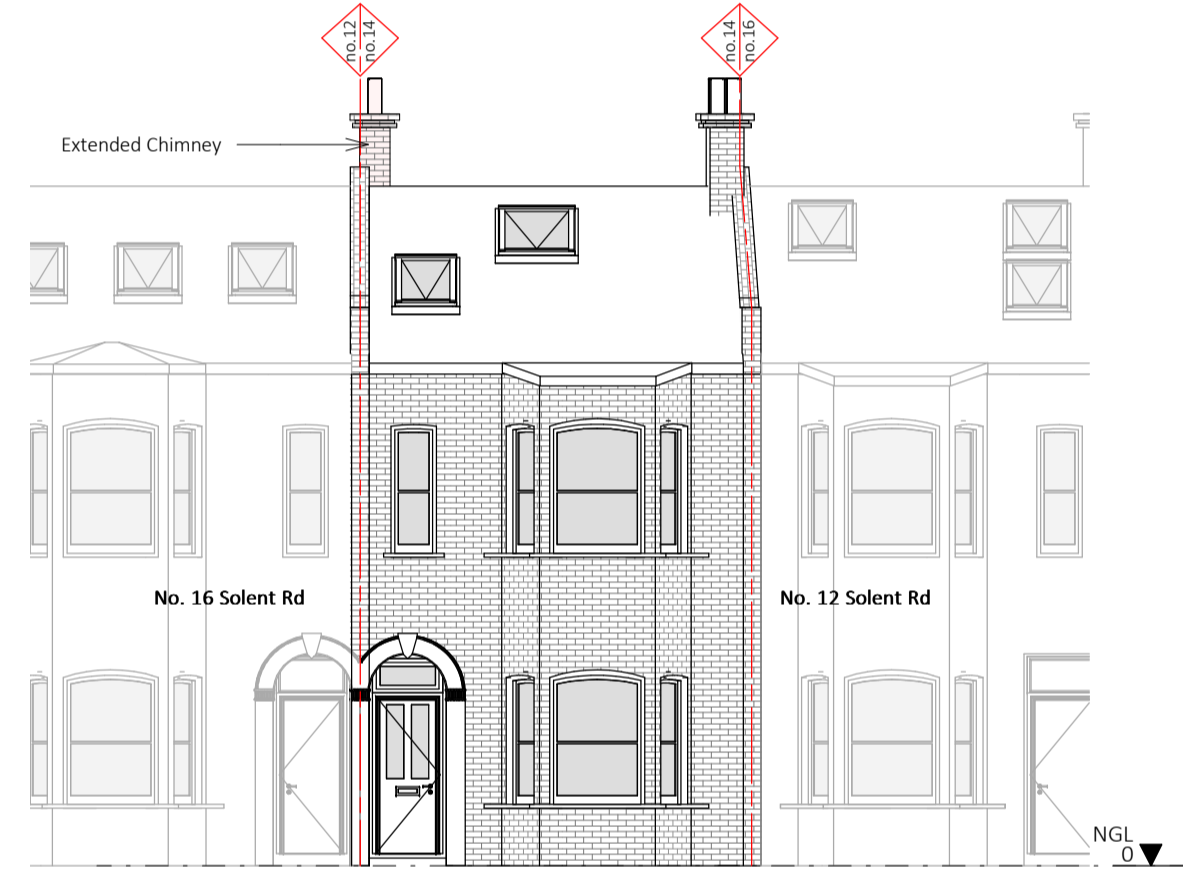
Proposed South Elevation scale 1 : 100