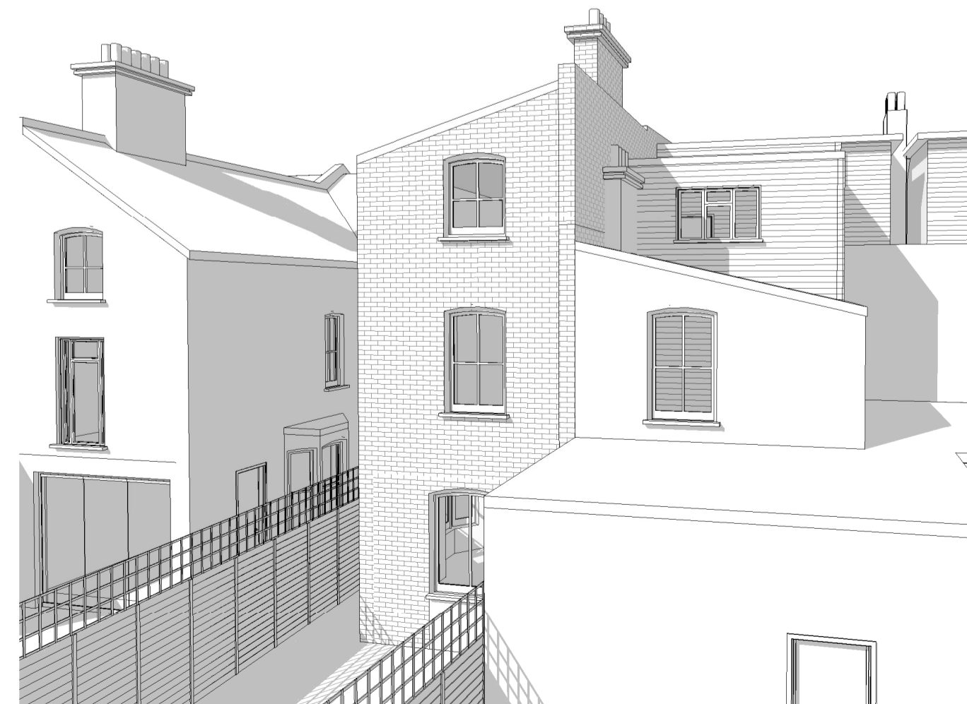
3D View 2_Proposed