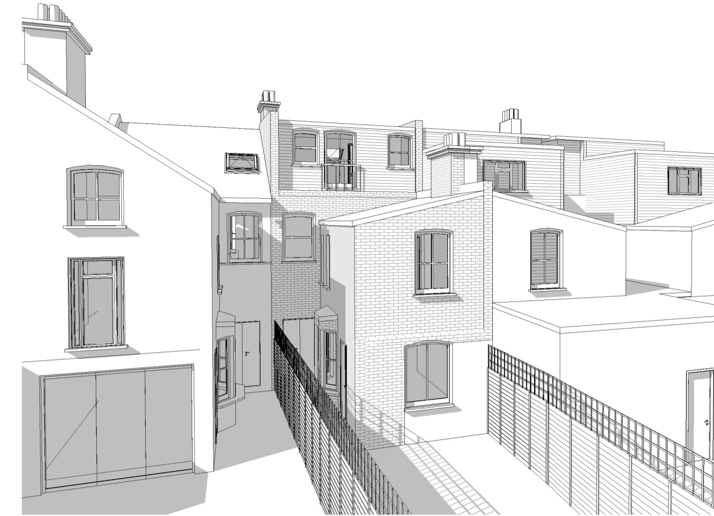
3D View 1_Existing