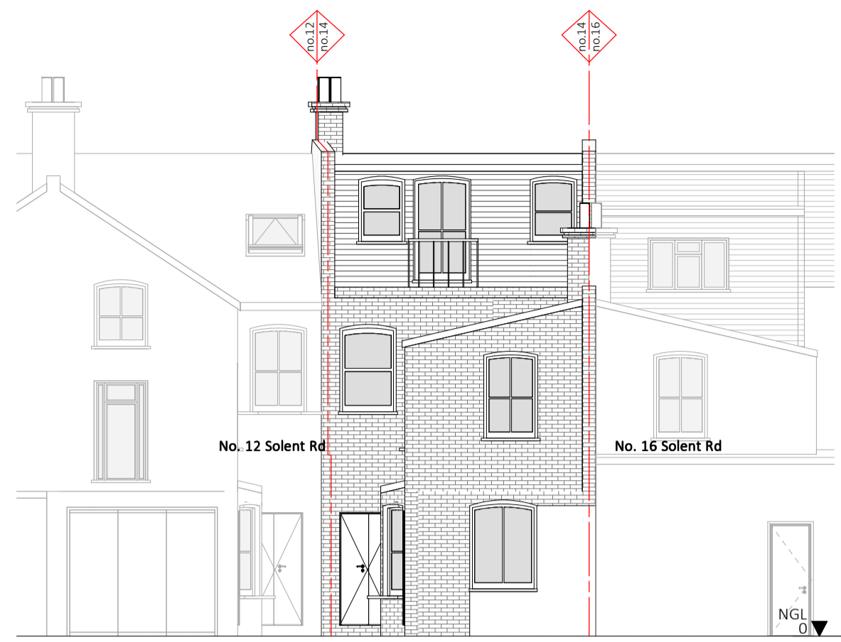
Existing North Elevation scale 1:100