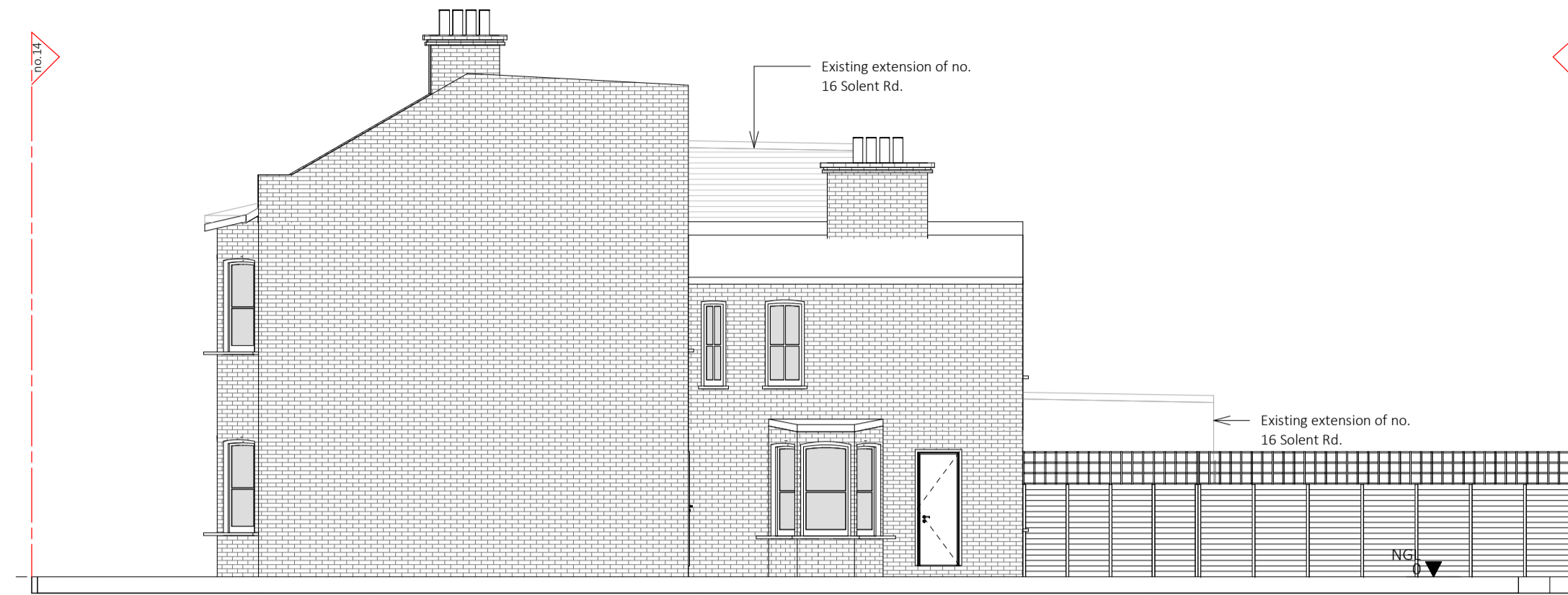
Existing East Elevation scale 1:100