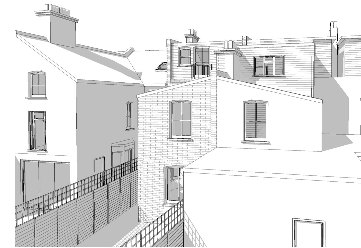
3D View 2_Existing