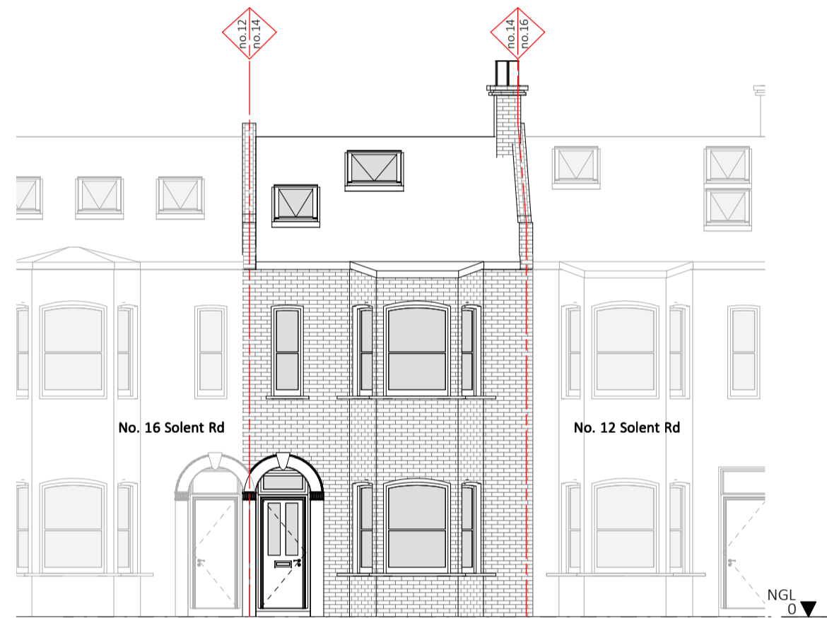
Existing South Elevation scale 1:100