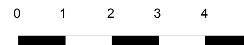
PROPOSED GROUND FLOOR PLAN 1:50 @ A1