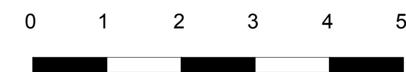
PROPOSED CELLAR FLOOR PLAN 1:50 @ A1