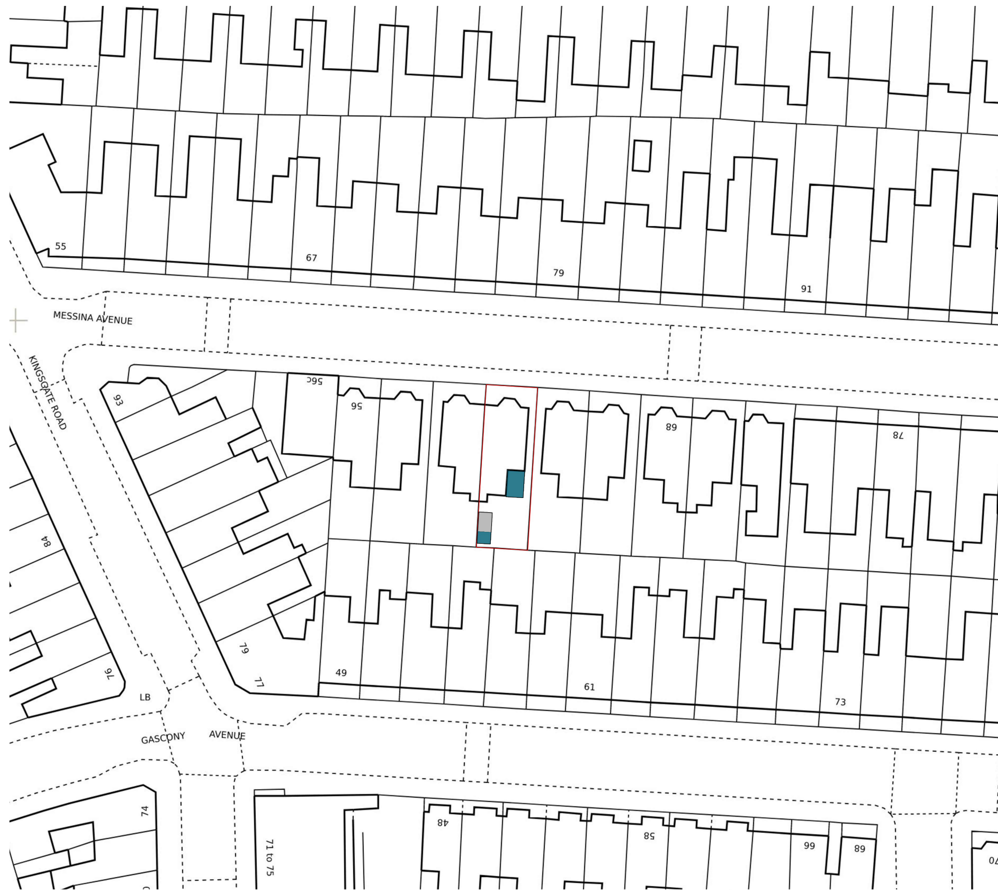
Proposed Block Plan

Any dimensions shown should be checked on site and discrepancies reported to the Architect prior to construction. Designs are not coordinated with engineer projects. Do not scale for construction purposes.