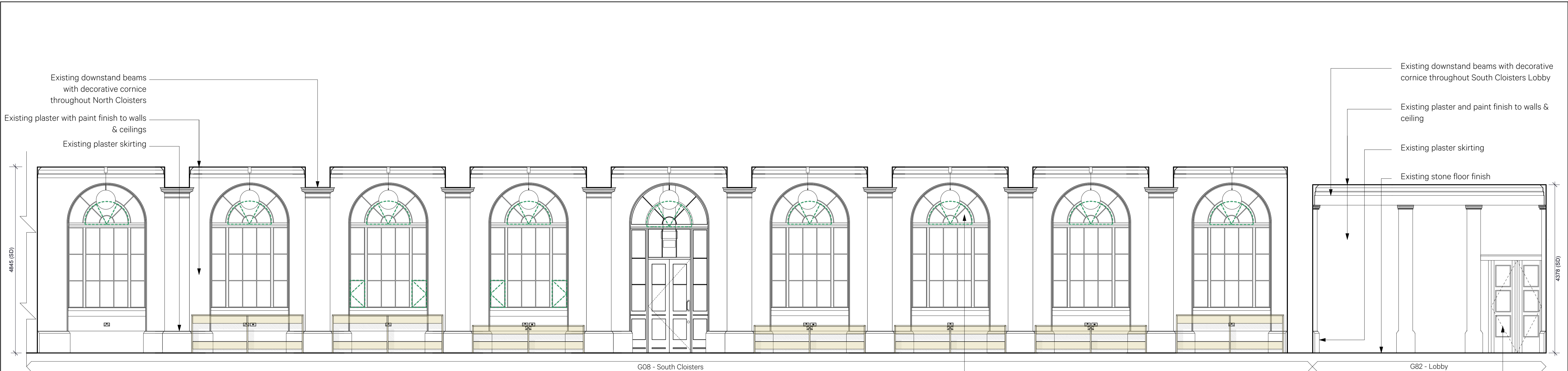
1 Existing Elevation A 1:50@ A1 / 1:100@A3

Existing painted single glazed timber windows with inward opening vent at high level throughout South Cloisters