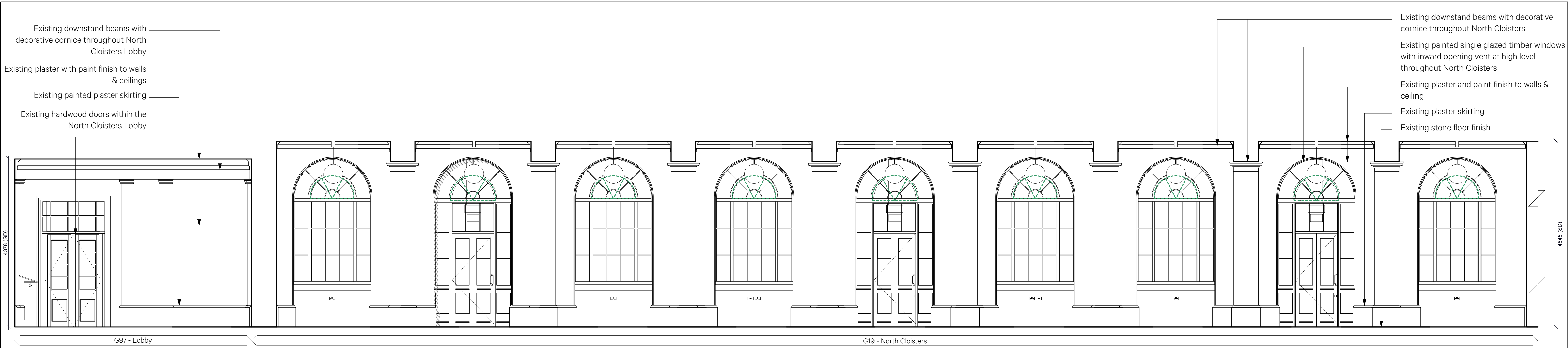
1 Existing Elevation A 150@A1/1:100@A3