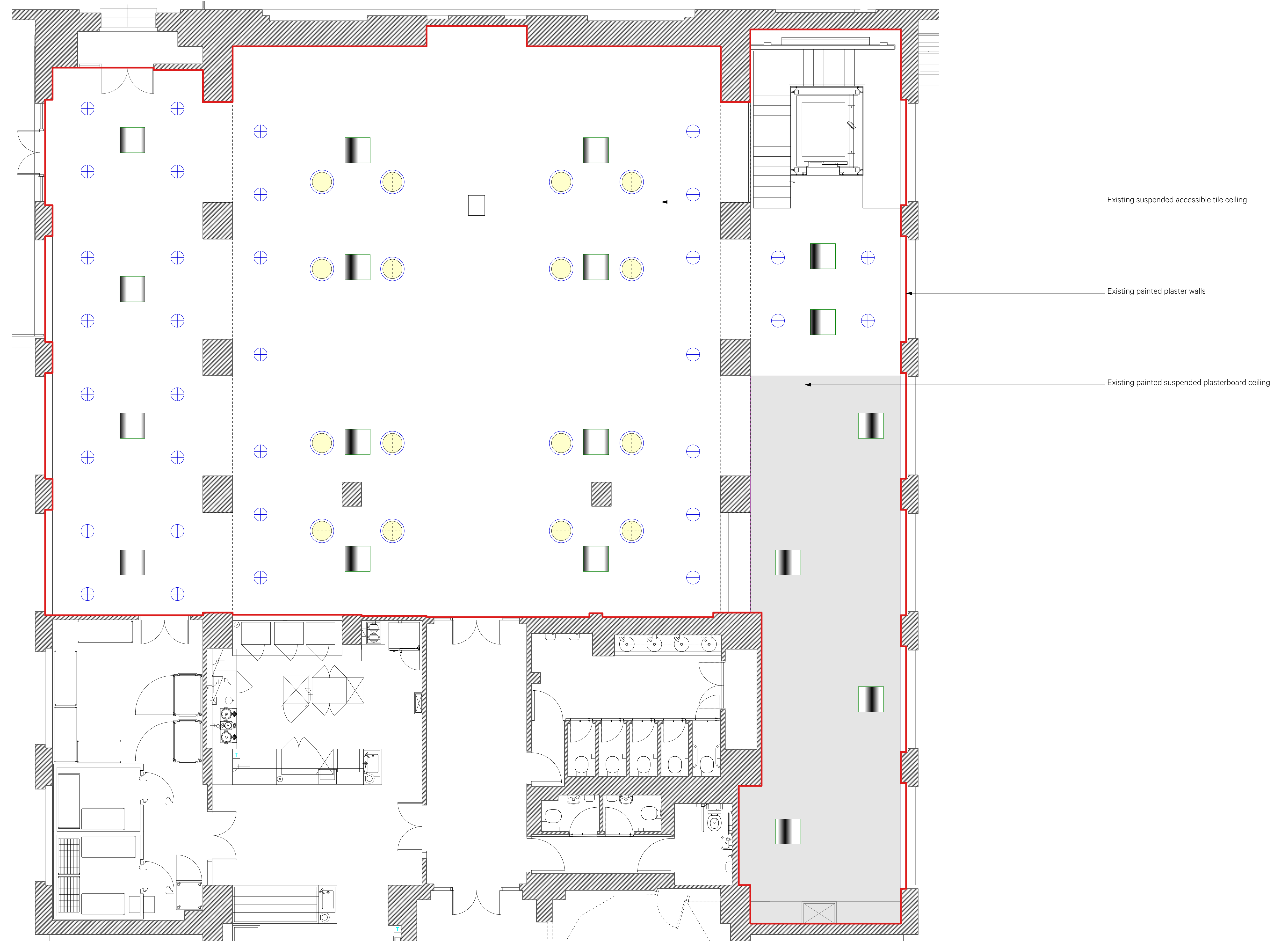
1 Jeremy Bentham Room Existing RCP 150@A1/1100@A3