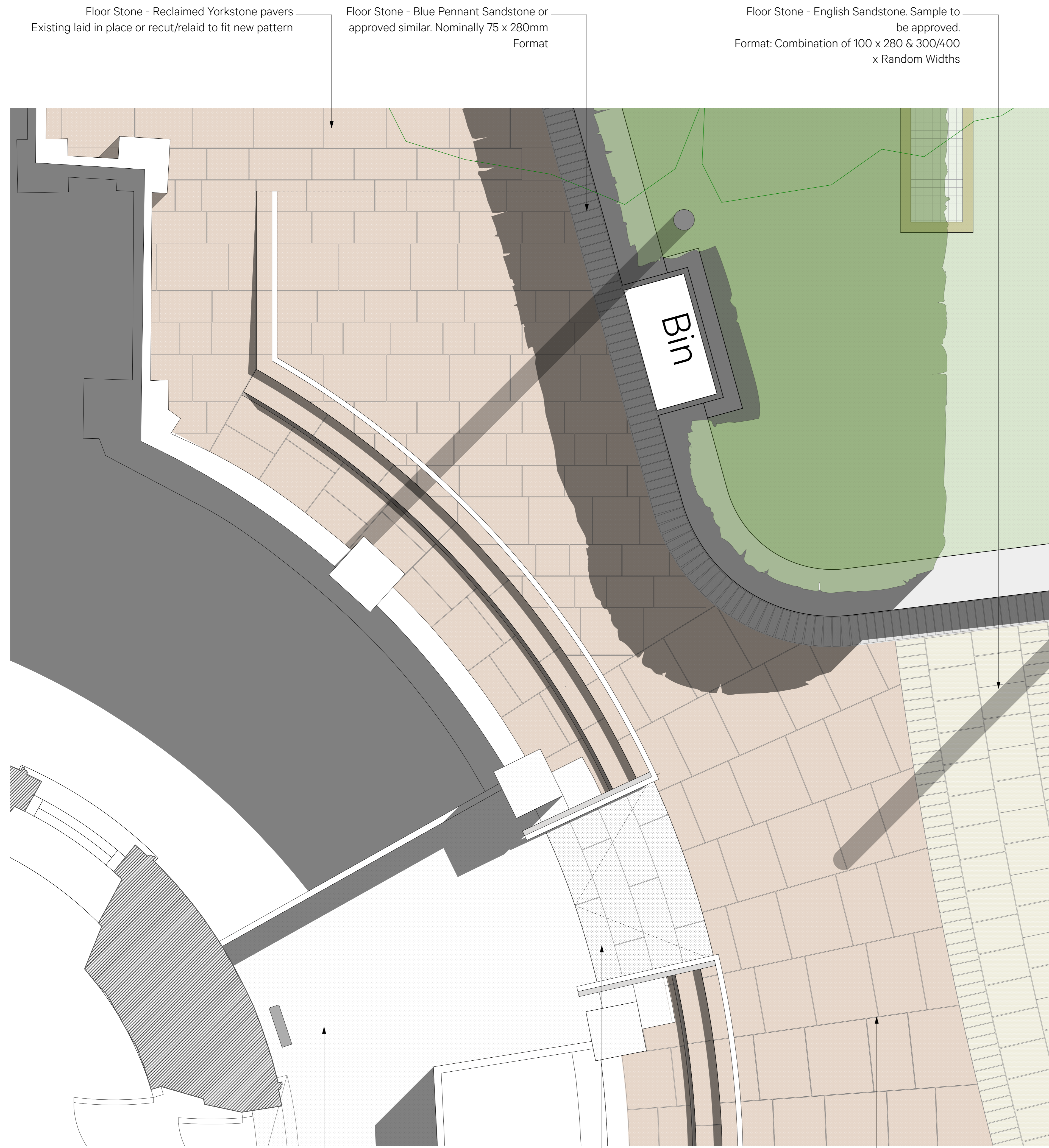
1 Area 01 - Slade Entrance Scale: 1:20 @ A0

NOTE: All stone sizes are nominal and will be sized to minimise carbon output from the quarry