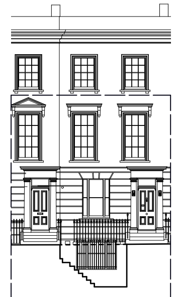
3 Elevation Key 1:200 @ A3