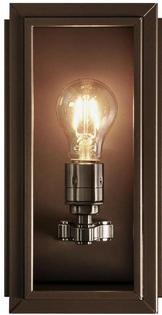
Proposed external lights Windsor British Box Light - Small 240 x 140mm

Wall mounted external Stucco pilasters flanking the raised entrance door on a timer.