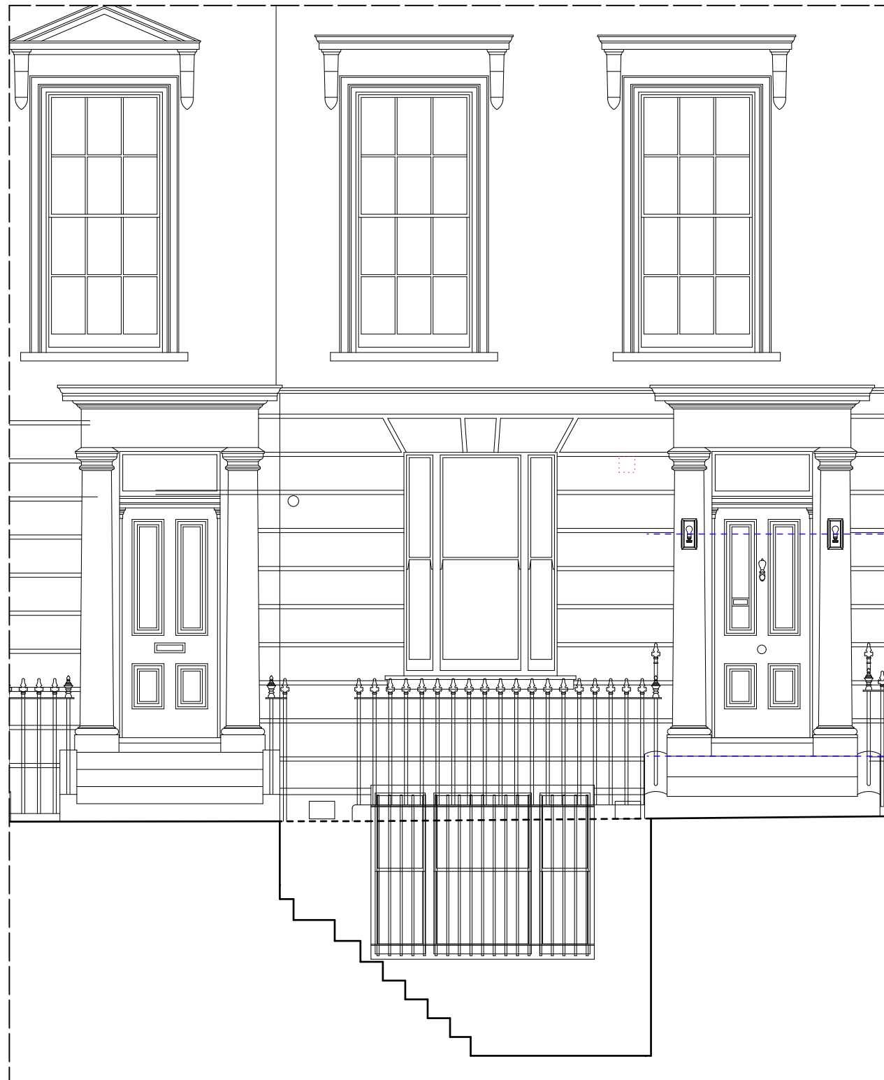
2 Proposed Front Elevation 1:50 @ A3