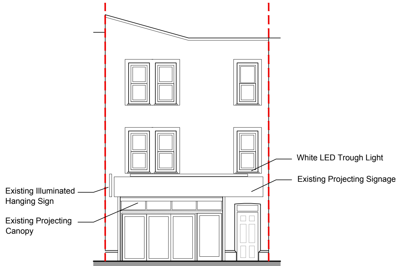
EXISTING ELEVATION A Pharmacy | Fleet Road