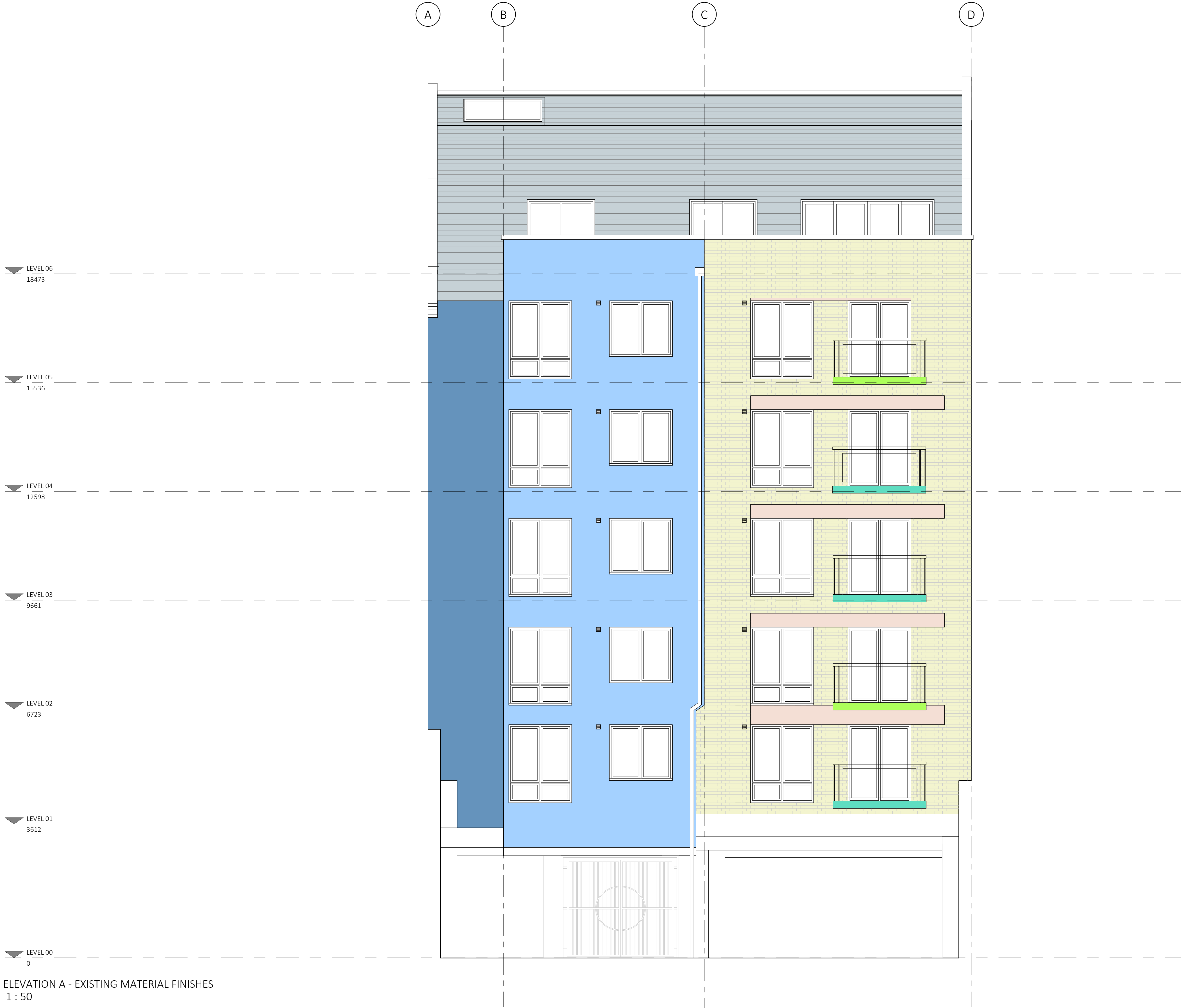
ELEVATION A - EXISTING MATERIAL FINISHES 1 : 50