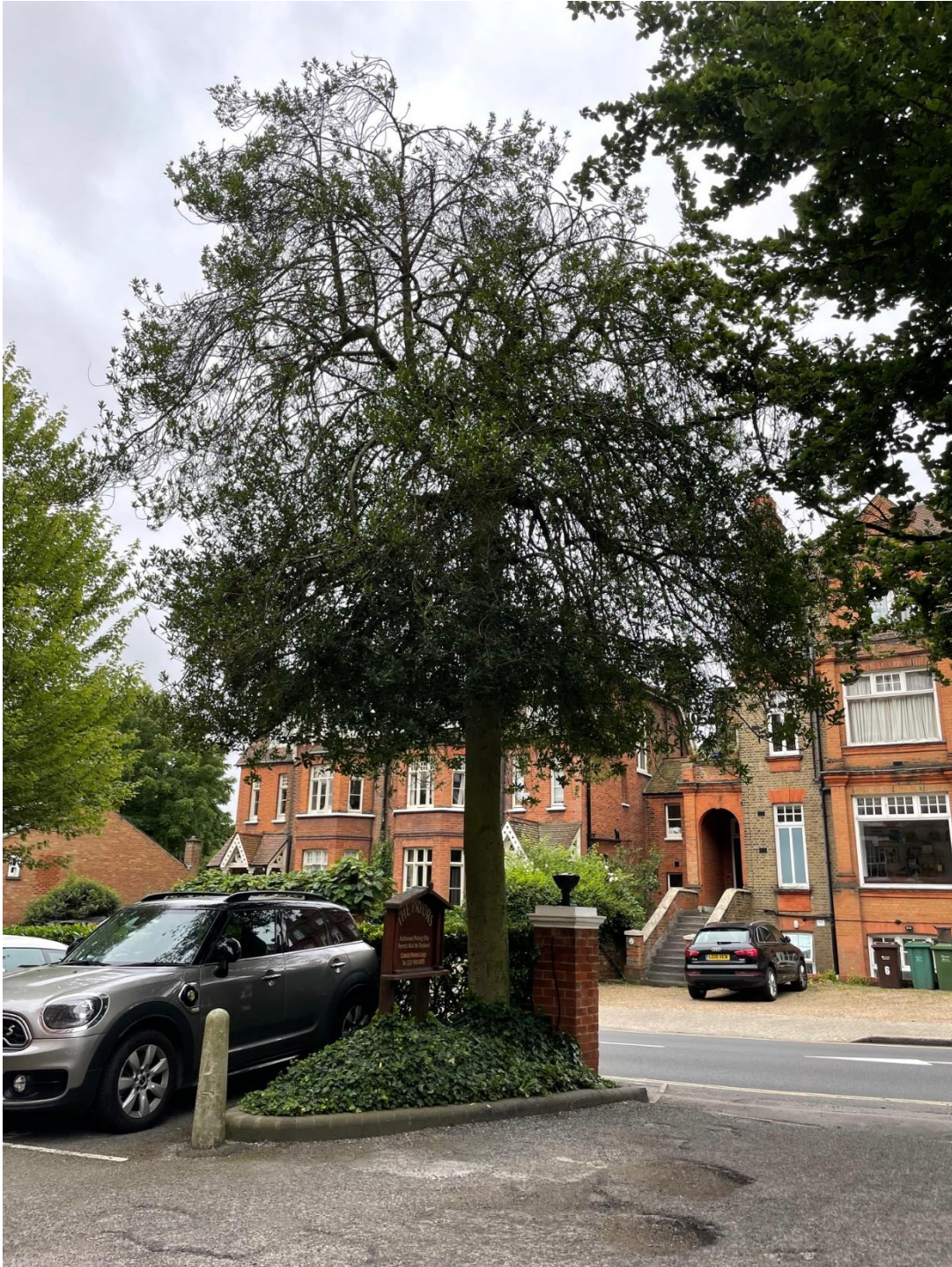
T3 – HOLLY