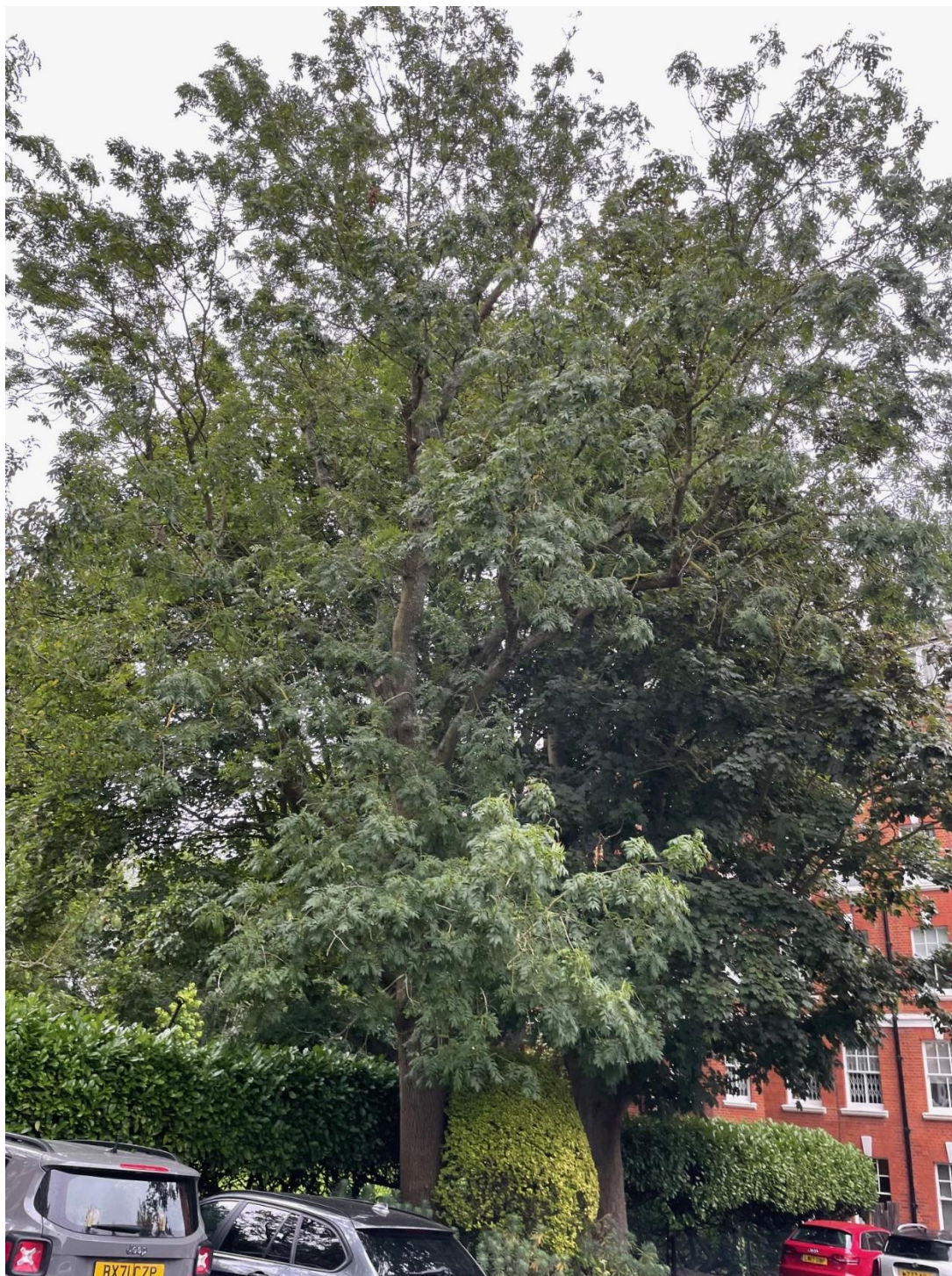
T10 – COMMON ASH