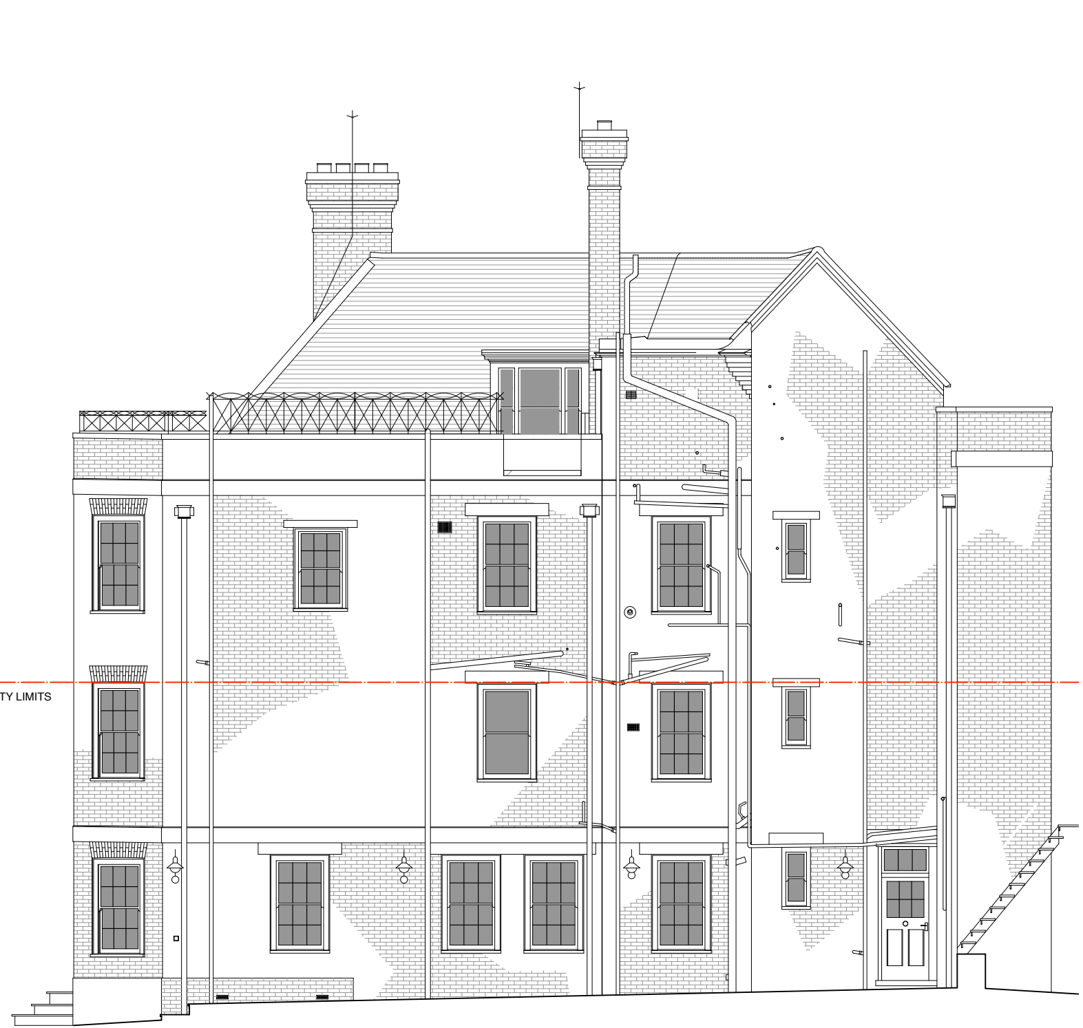
EXISTING SIDE-2 ELEVATION