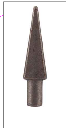
BRUNDLES RAILHEAD 05G905