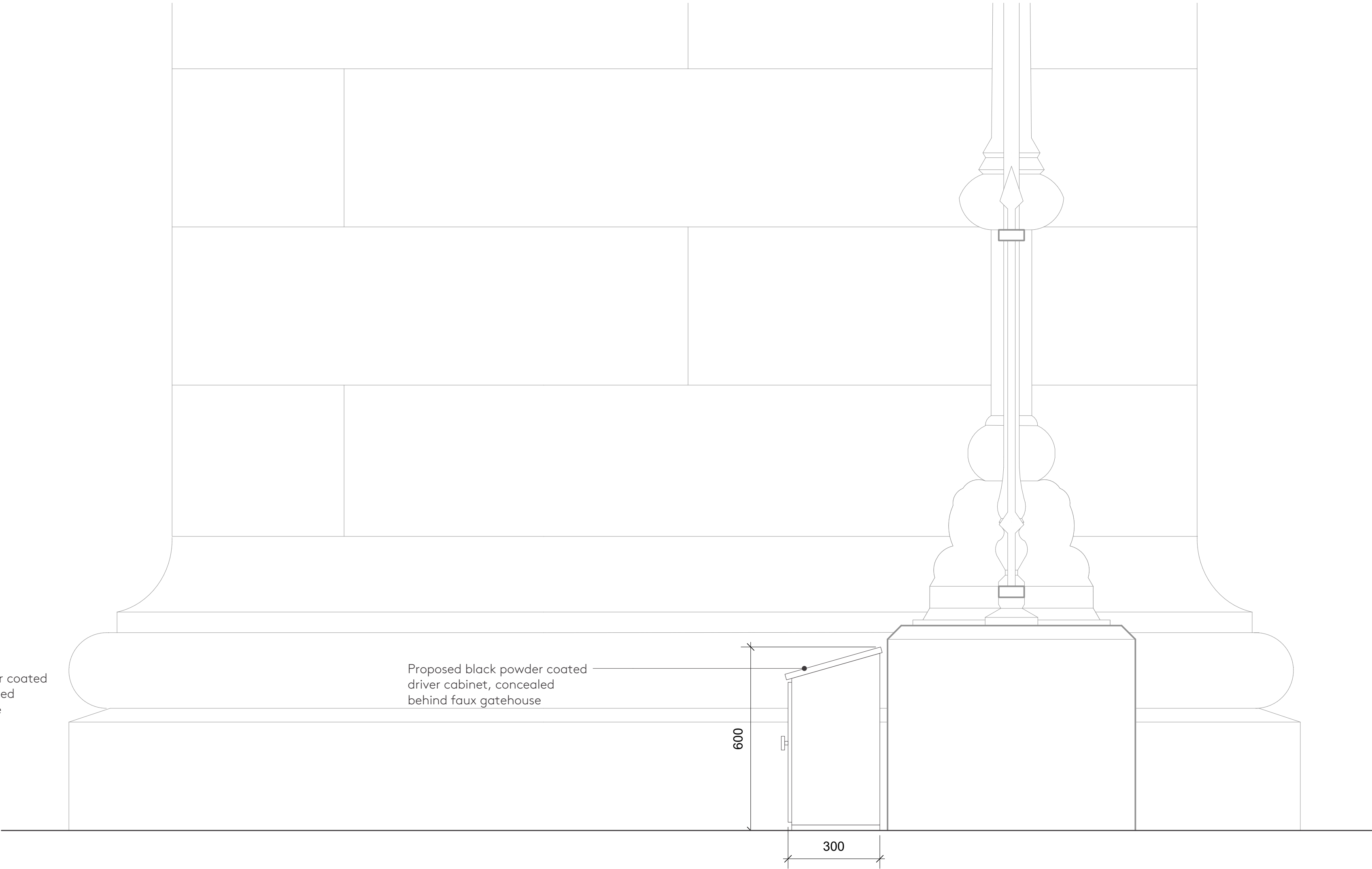
2 Typical Driver Cabinet - Side Elevation Scale: 1:10

Nex— 55 Whitfield St, London W1T 4AH e: office@nex-architecture.com t: +44 20 7183 0900