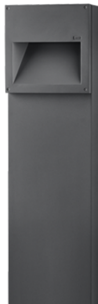
WE-EF QSI254 LED bollard light