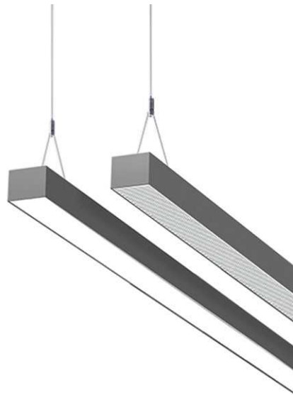
Optelma Quad 81 Flat linear light

DO NOT SCALE DRAWINGS. USE DIMENSIONED DRAWINGS ONLY. ALL DIMENSIONS TO BE CHECKED PRIOR TO COMMENCEMENT OF ANY WORKS. AND / OR PREPARATION OF ANY SHOP DRAWINGS. ALL DISCREPANCIES TO BE REPORTED TO THE ARCHITECT. THIS DRAWING TO BE READ IN CONJUNCTION WITH ALL OTHER ARCHITECTS DRAWINGS AND SPECIFICATIONS AND OTHER CONSULTANTS INFORMATION ALL STRUCTURAL ELEMENTS TO BE CROSS CHECKED WITH ENGINEERS DOCUMENTS