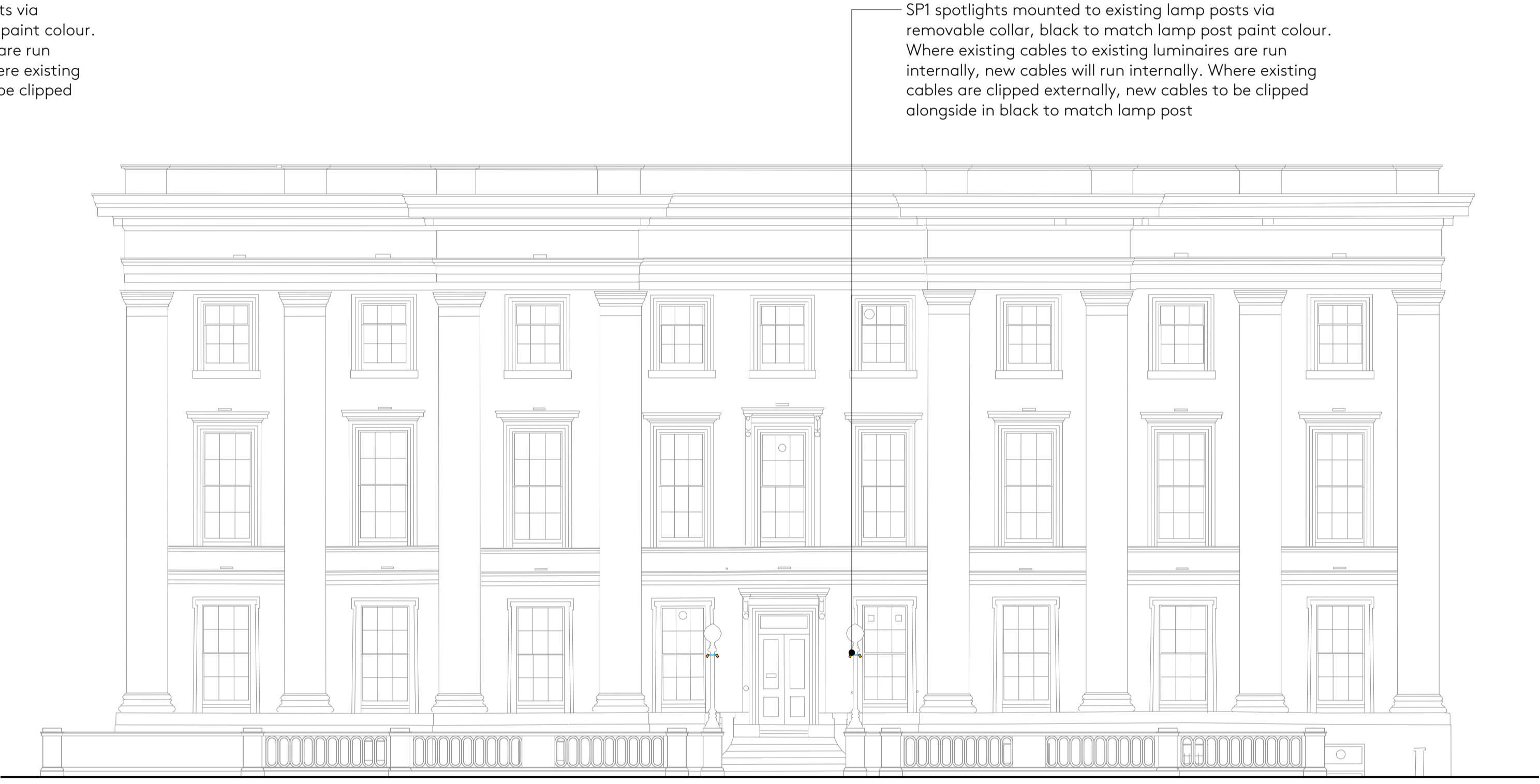
2 East Residence East Elevation - Proposed Scale: 1:100