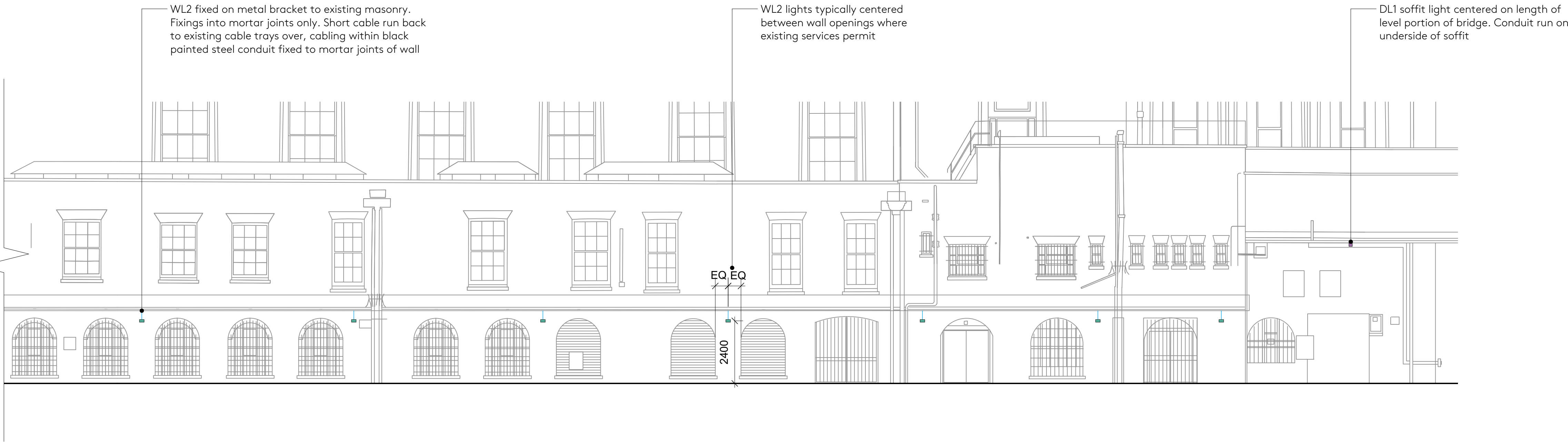
2 East Road - East Elevation North End (Proposed) Scale: 1:100