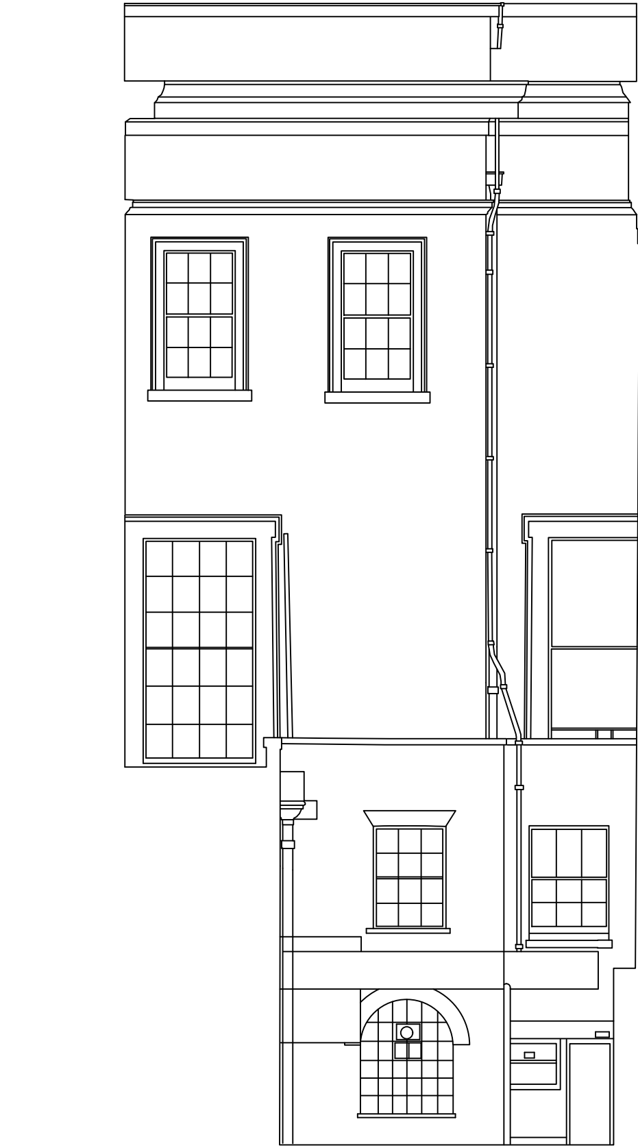
1 East Road - Partial East Elevation (Existing) Scale: 1:100