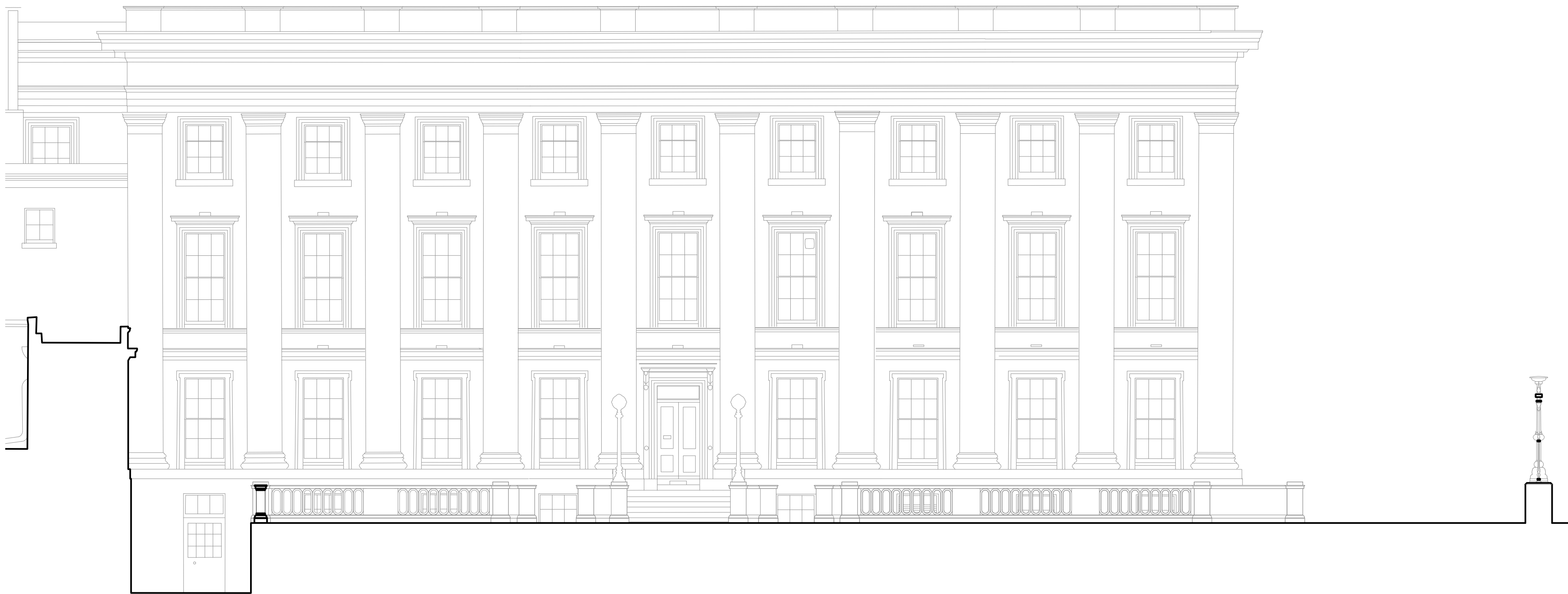
1 South Forecourt - East End - West Elevation Scale: 1:100