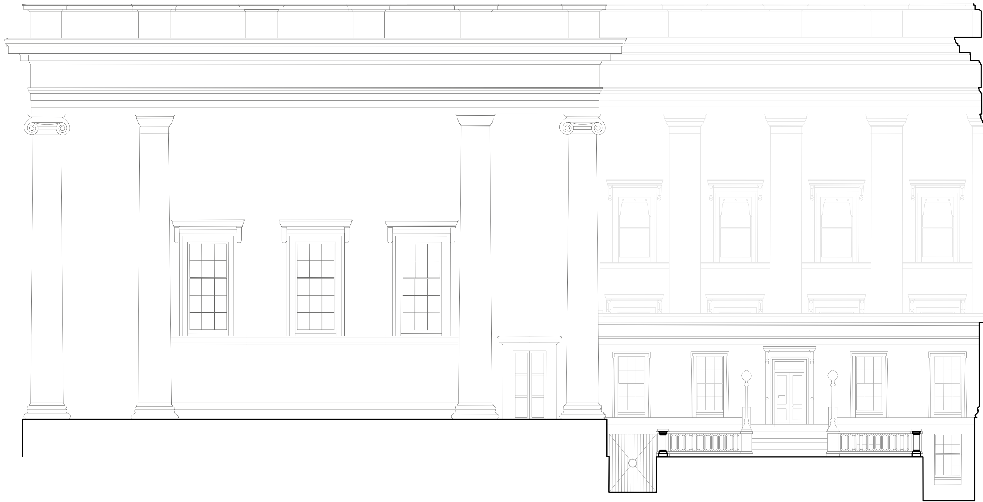
2 South Forecourt - East End - South Elevation Scale: 1:100