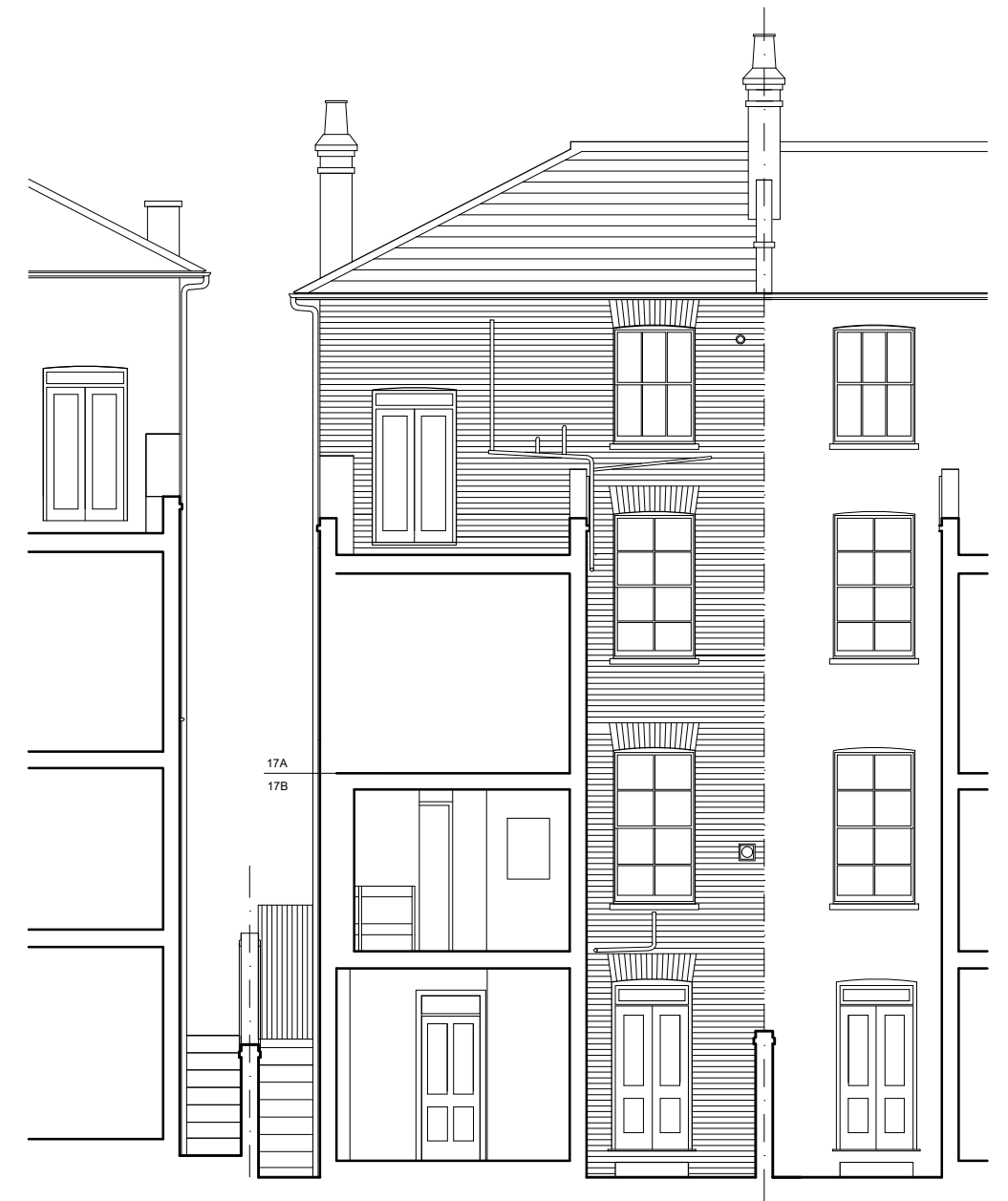
EXISTING SECTION 03