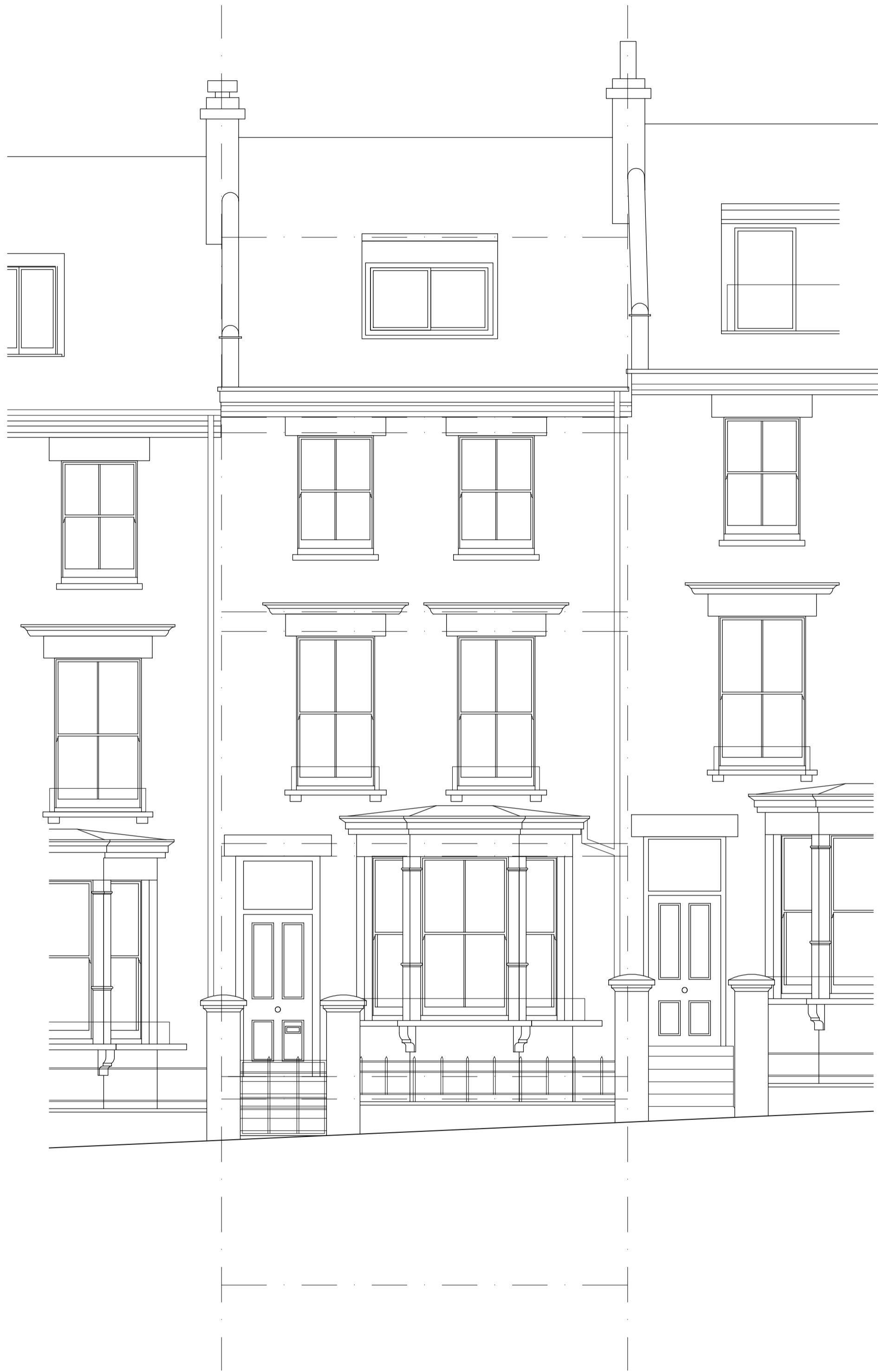
1 PROPOSED FRONT ELEVATION PRIMROSE HILL, 20 AINGER ROAD SCALE 1:50