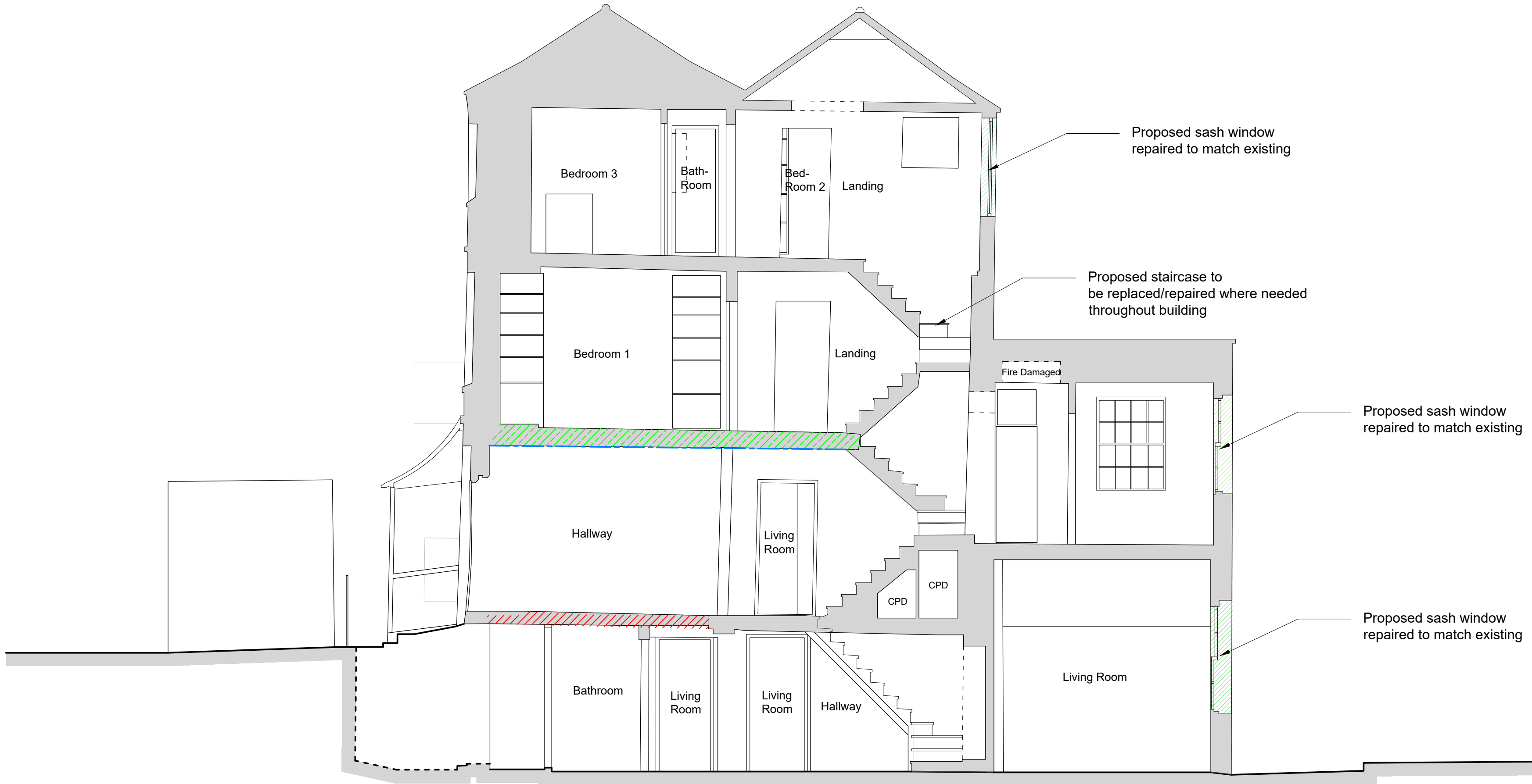
Proposed Section (Overall layout unaffected by the works)