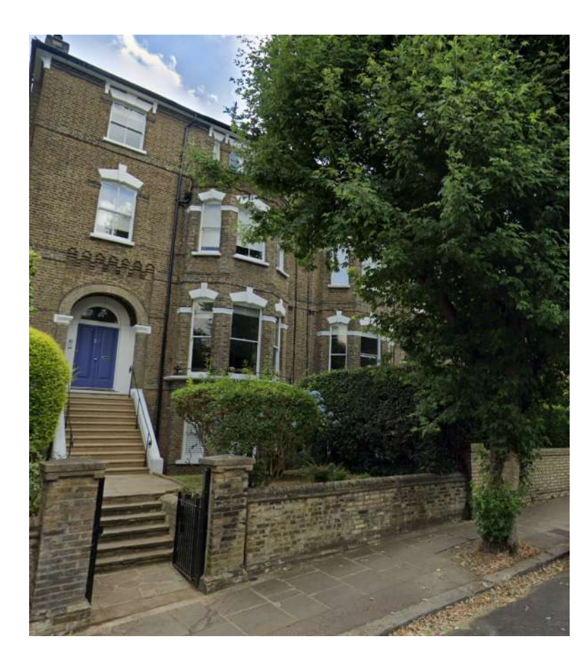
PEDESTRIAN GATE AT No24

PLANNING PERMISSION GRANTED FOR THESE 2X METAL VEHICULAR AND 1XPEDESTRIAN AUTOMATED GATES AND ERECTION OF METAL RAILINGS ABOVE BOUNDARY WALLS REF.2010/4145/P FULL PLANNING GRANTED IN 25-02-2015 AT No 20