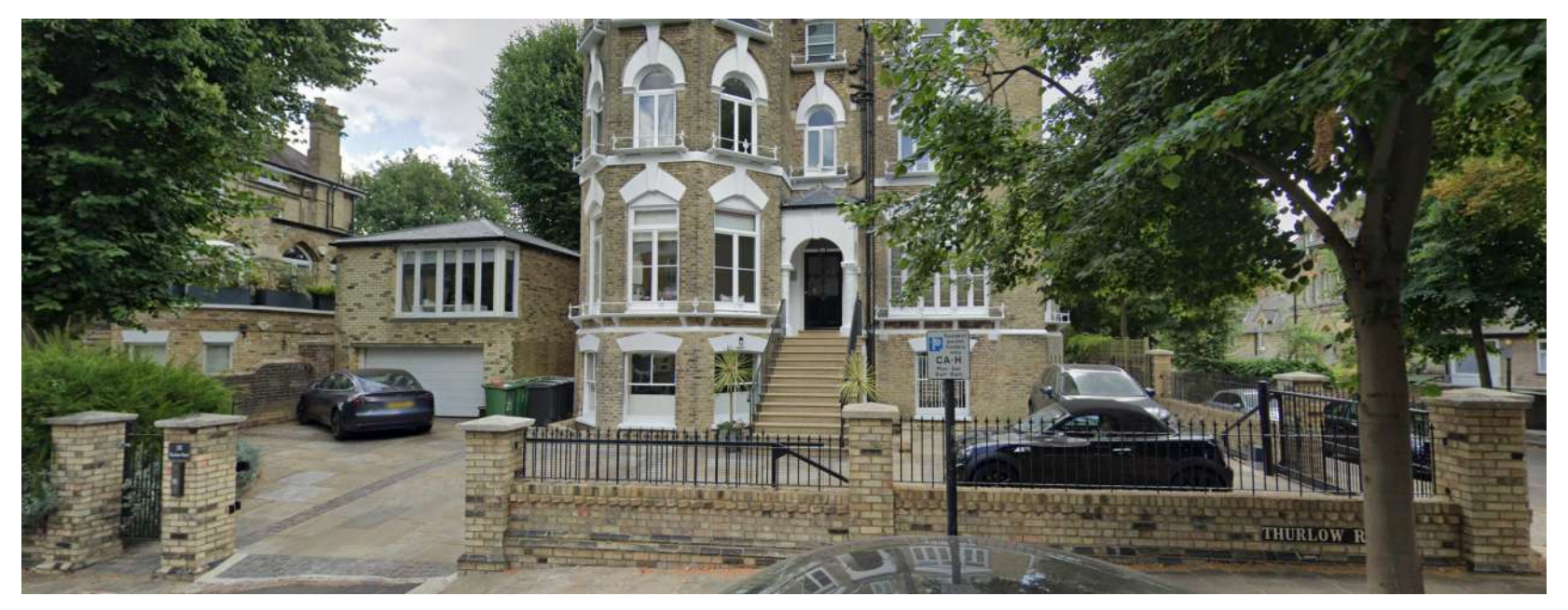
2X VEHICULAR & 1XPEDESTRIAN GATE AT THURLOW ROAD No20 NW3 5PD (ALL AUTOMATED)

PLANNING PERMISSION GRANTED FOR THESE 2X METAL VEHICULAR AND 1XPEDESTRIAN AUTOMATED GATES AND ERECTION OF METAL RAILINGS ABOVE BOUNDARY WALLS REF.2010/4145/P FULL PLANNING GRANTED IN 25-02-2015 AT No 20