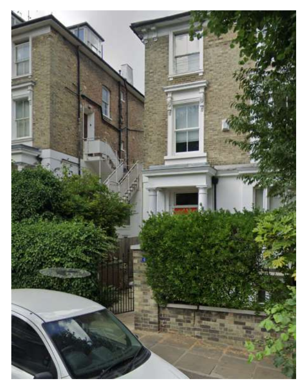
PEDESTRIAN GATE AT No13&14