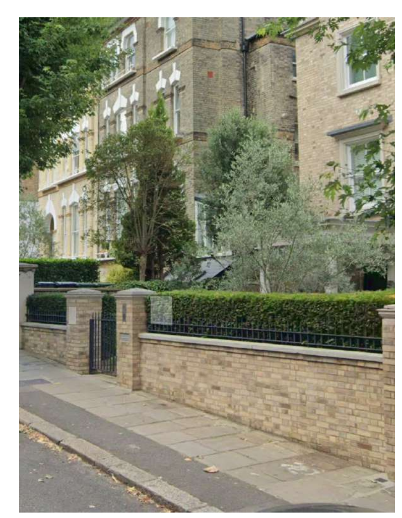
PEDESTRIAN GATE AT No12 WITH METAL RAILINGS ON BOUNDARY WALL