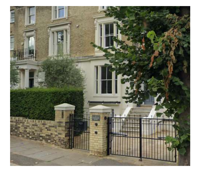
VEHICULAR & PEDESTRIAN GATE AT THURLOW ROAD No1 (AUTOMATED)