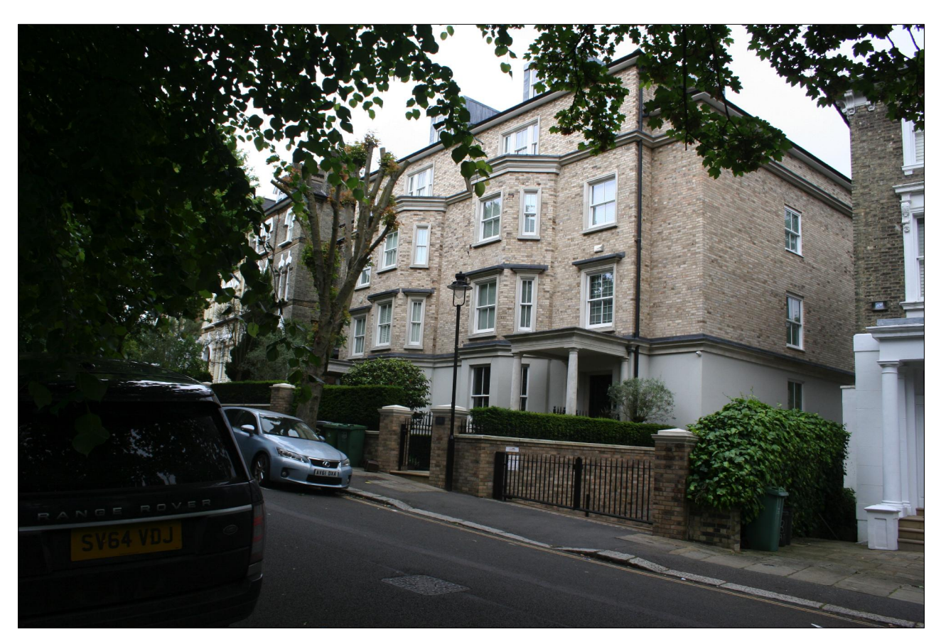
16-FRONT GATES AT No11 (ACROSS THE ROAD)