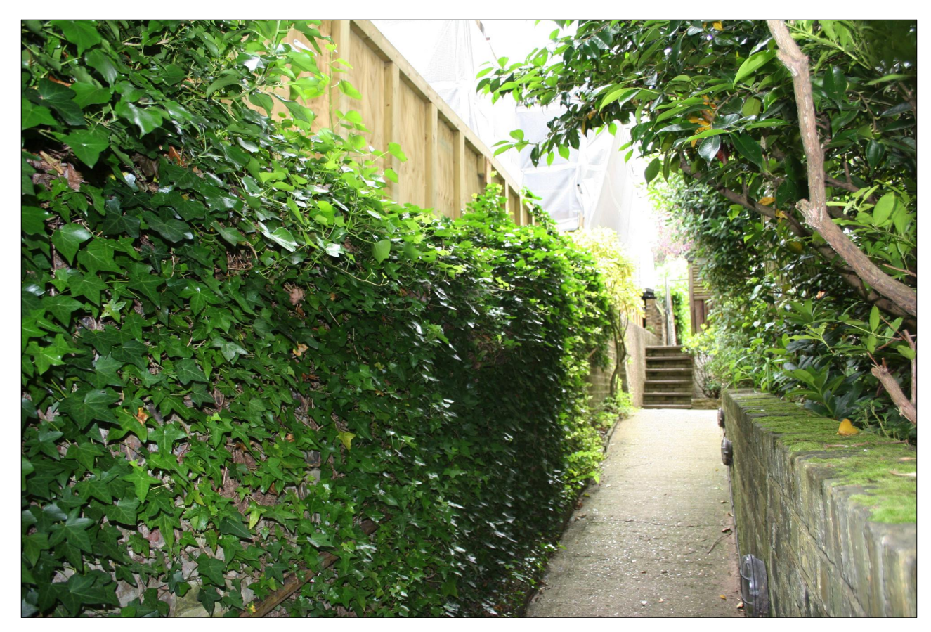
14-No27 & 26 BOUNDARY WALL AND FRONT PATH LEVELS AT No26