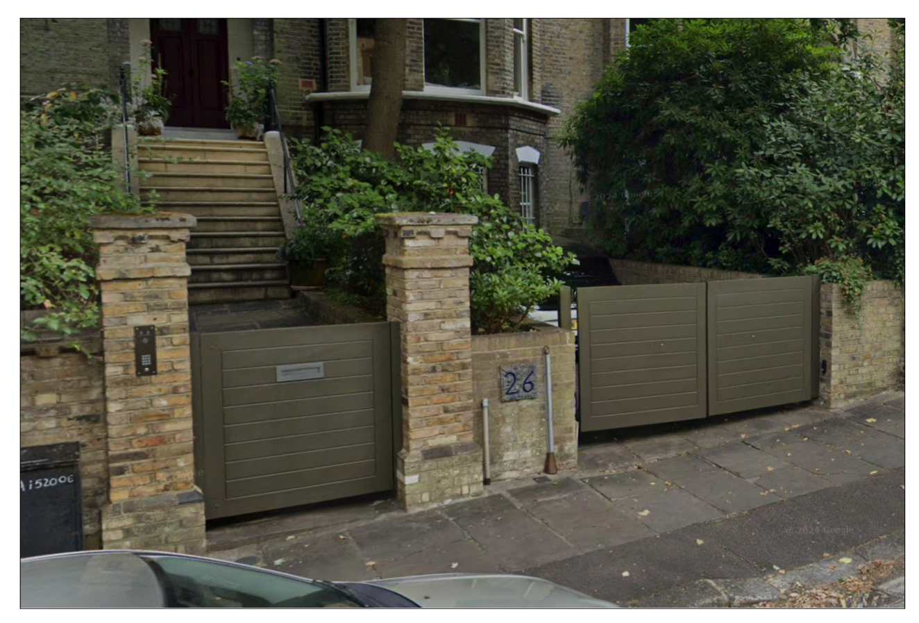
15-No 26 FRONT STEPS AND GATES