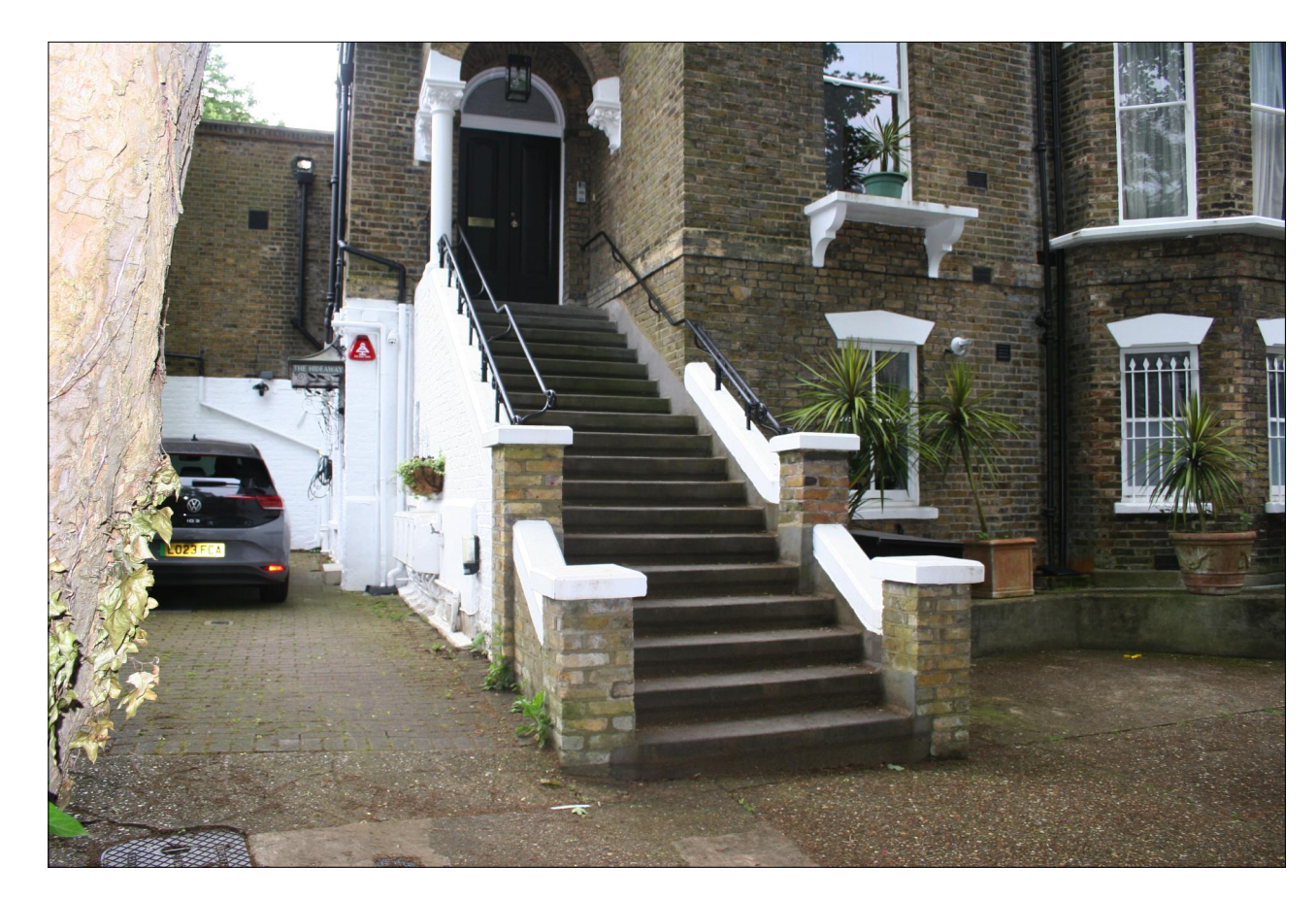
12-FRONT STEPS TO No28