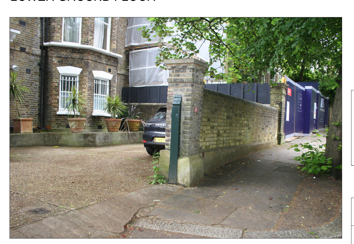
13- No28 & 27 BOUNDARY WALL AT THE FRONT AND PUBLIC PAVEMENT VIEW