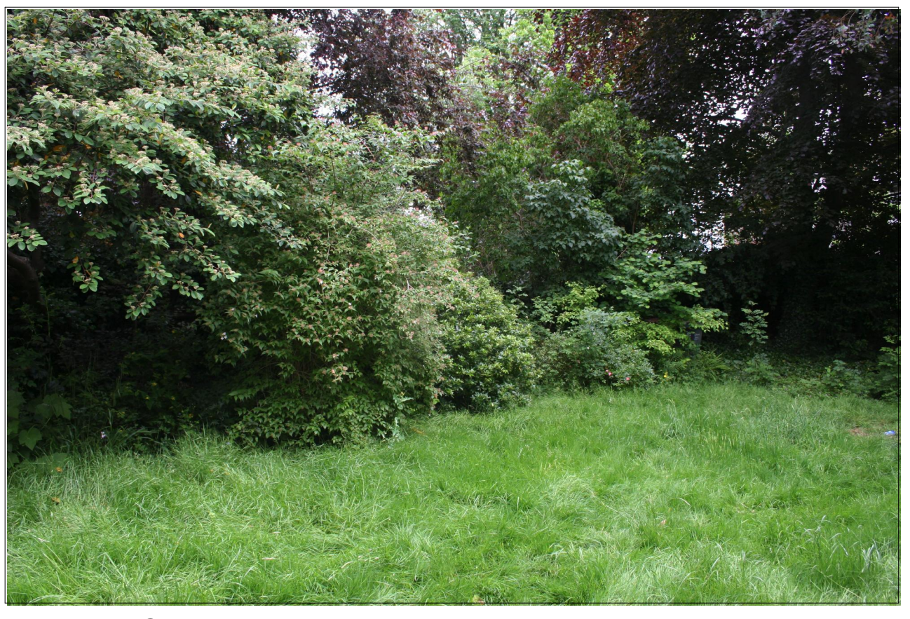
5-REAR GARDEN VIEW