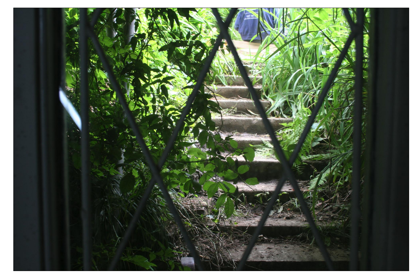
6-REAR ELEVATION GARDEN TO LOWER GROUND STEPS VIEW FROM LOWER GROUND FLOOR