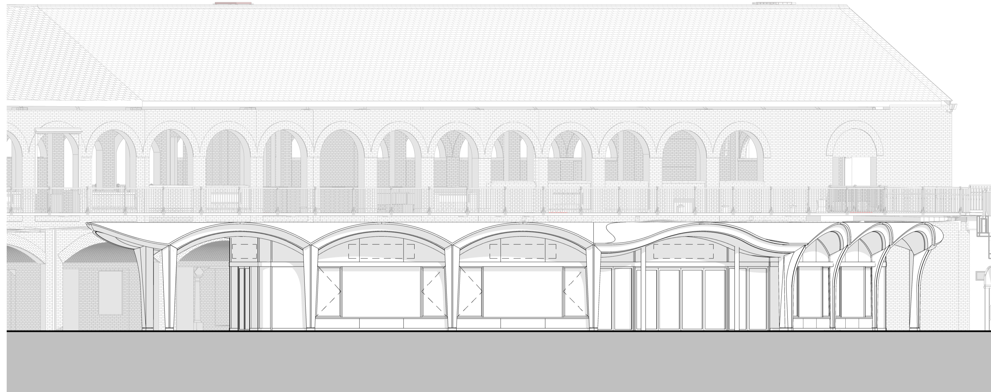
1 Context Elevation - North West - Proposed 1 : 100