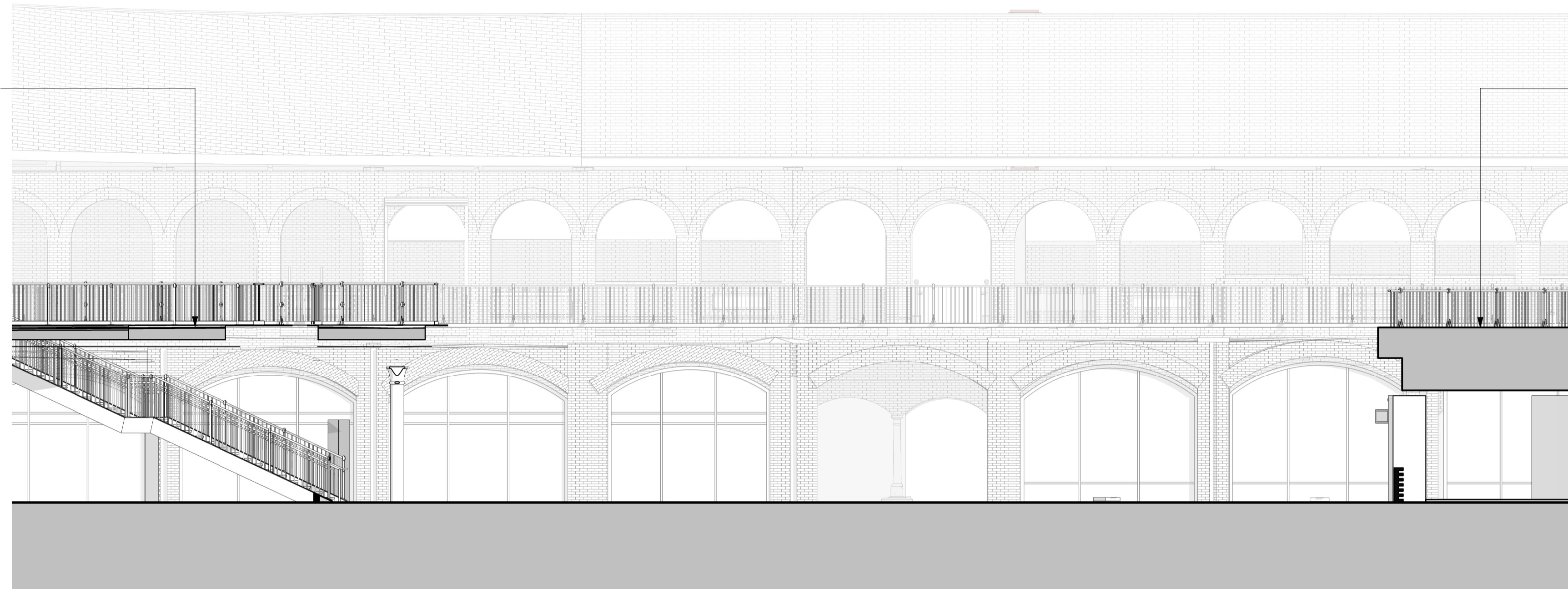
1 Elevation - West - Existing 1 : 100