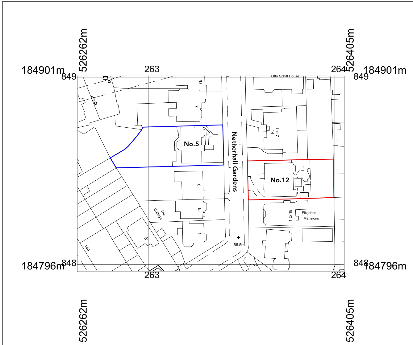
1 No.12: Existing Site Location Plan Scale: 1:1250