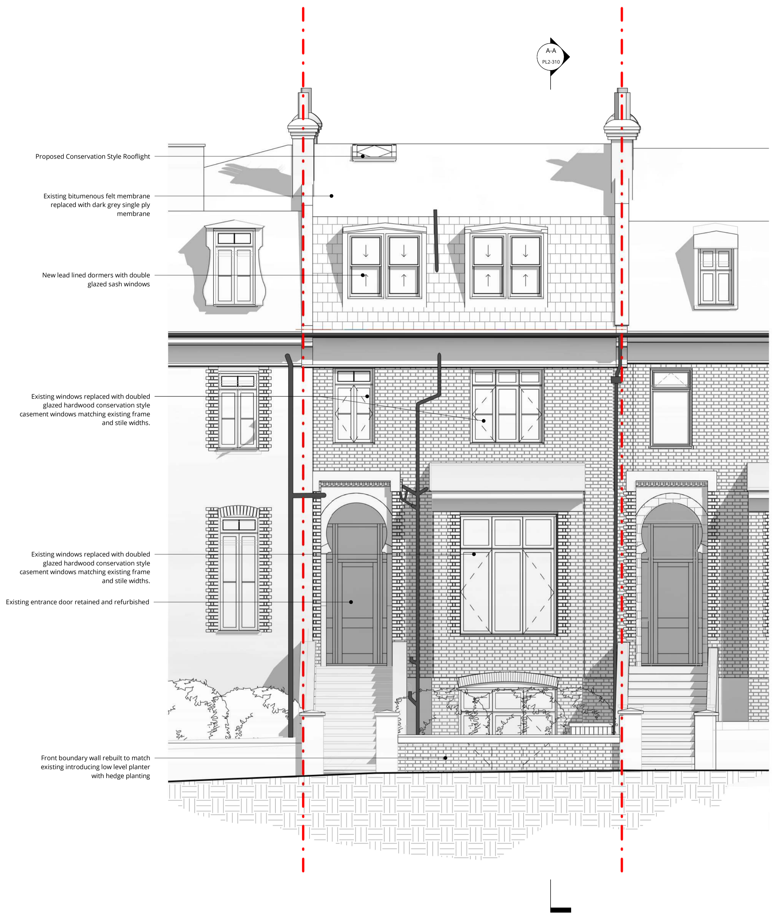
Proposed Front Elevation 1 : 50