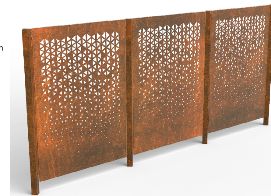
Precedent Image - Note image shows Corten finish when proposed product is for powder coated finish. Pattern shown is Pattern 8. Final pattern is subject to confirmation