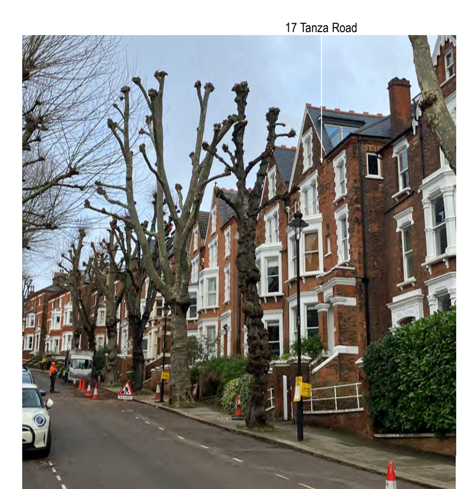
Context view looking up Tanza Road