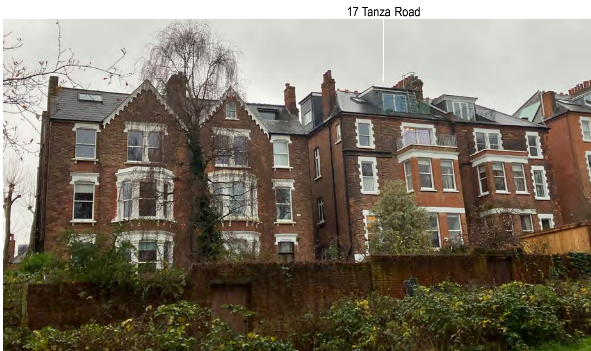
13 Tanza Road (Left) to 19 Tanza Road (Right) from the rear of the properties