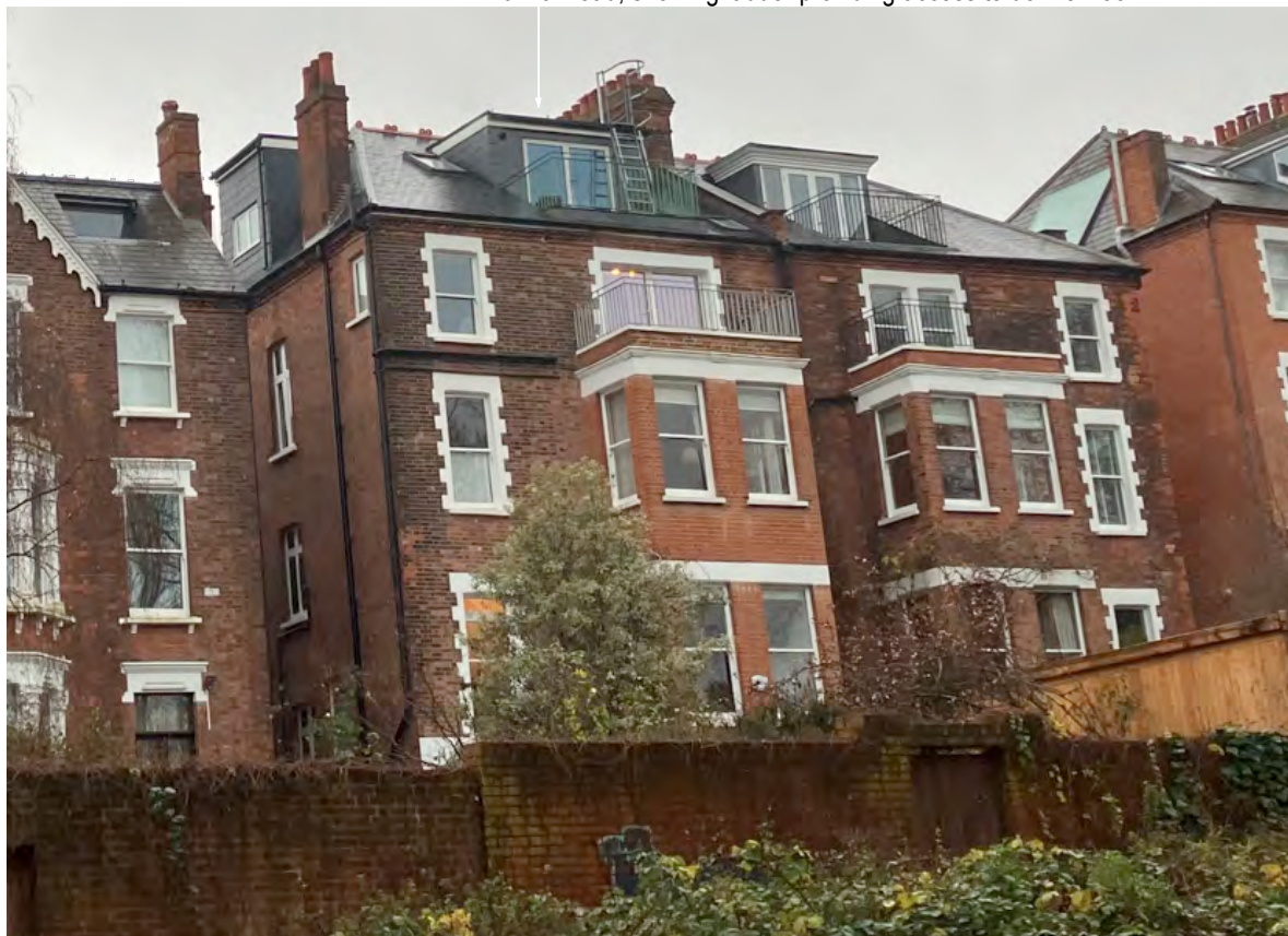
17 Tanza Road (Left) and 19 Tanza Road (Right) from the rear of the properties