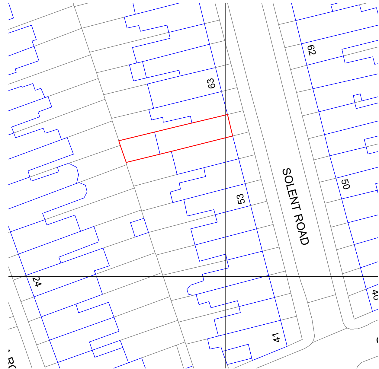
site plan 1:500 @ A3

59 Solent Road NW6 1TY Drawn By KO Scale AS NOTED Status Proposed Project Stage Planning