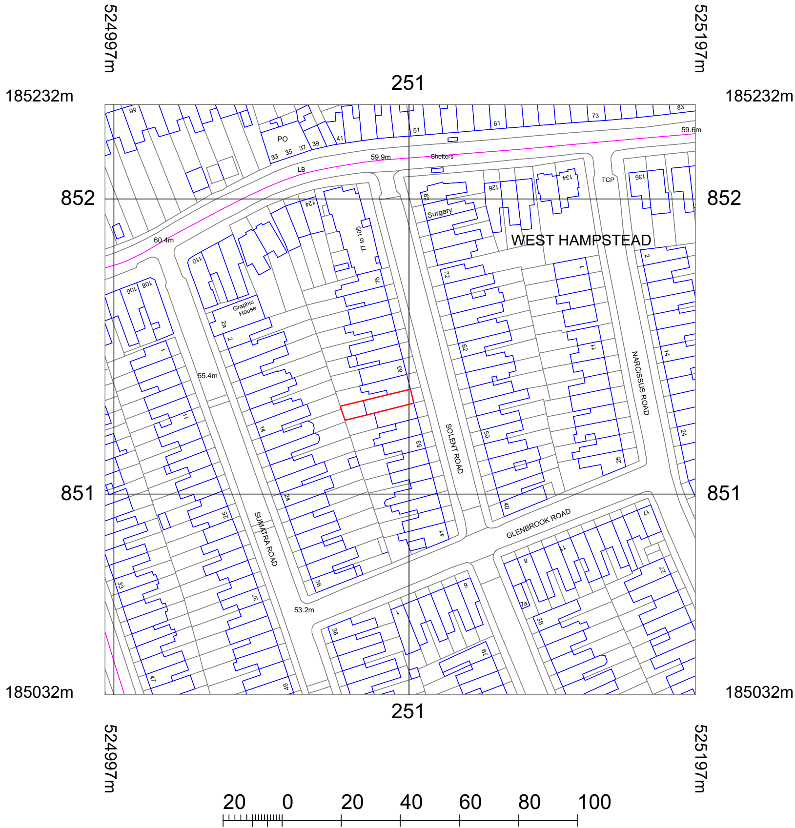
location plan 1:1250 @ A3