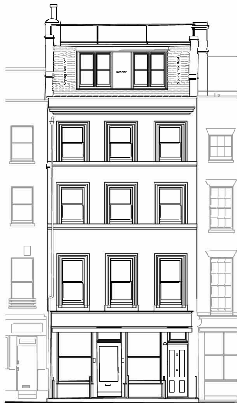
49.000m AD Front Elevation as Proposed