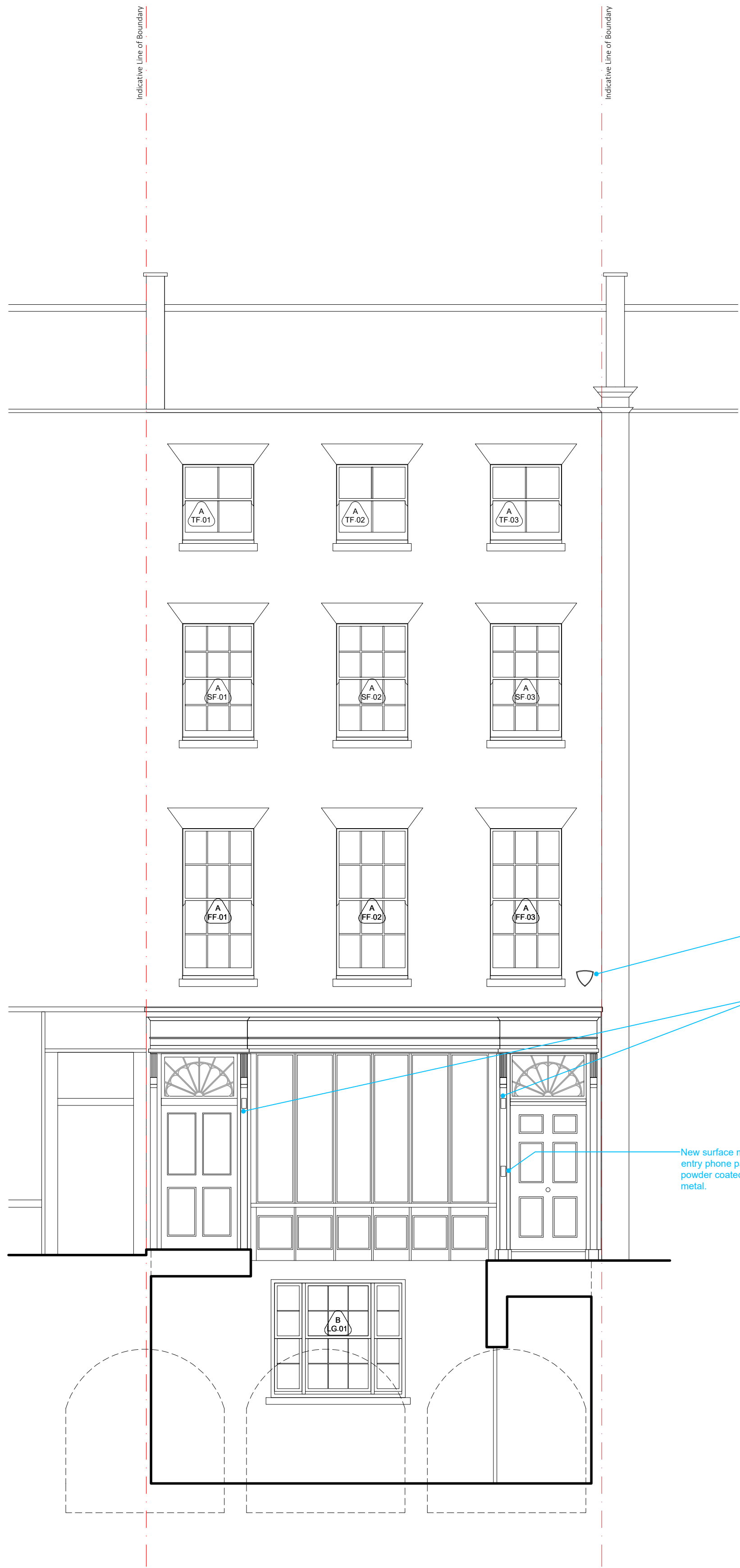
Proposed West Elevation Section_BB