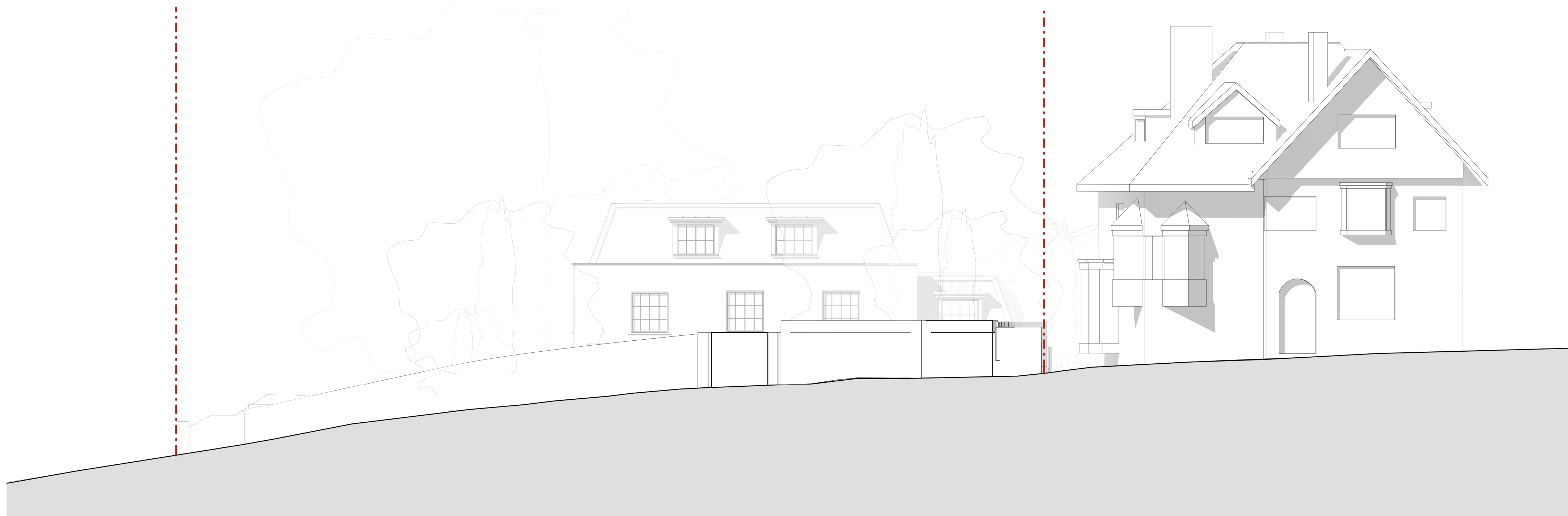
1 Proposed East Elevation from Church Row 1 : 100