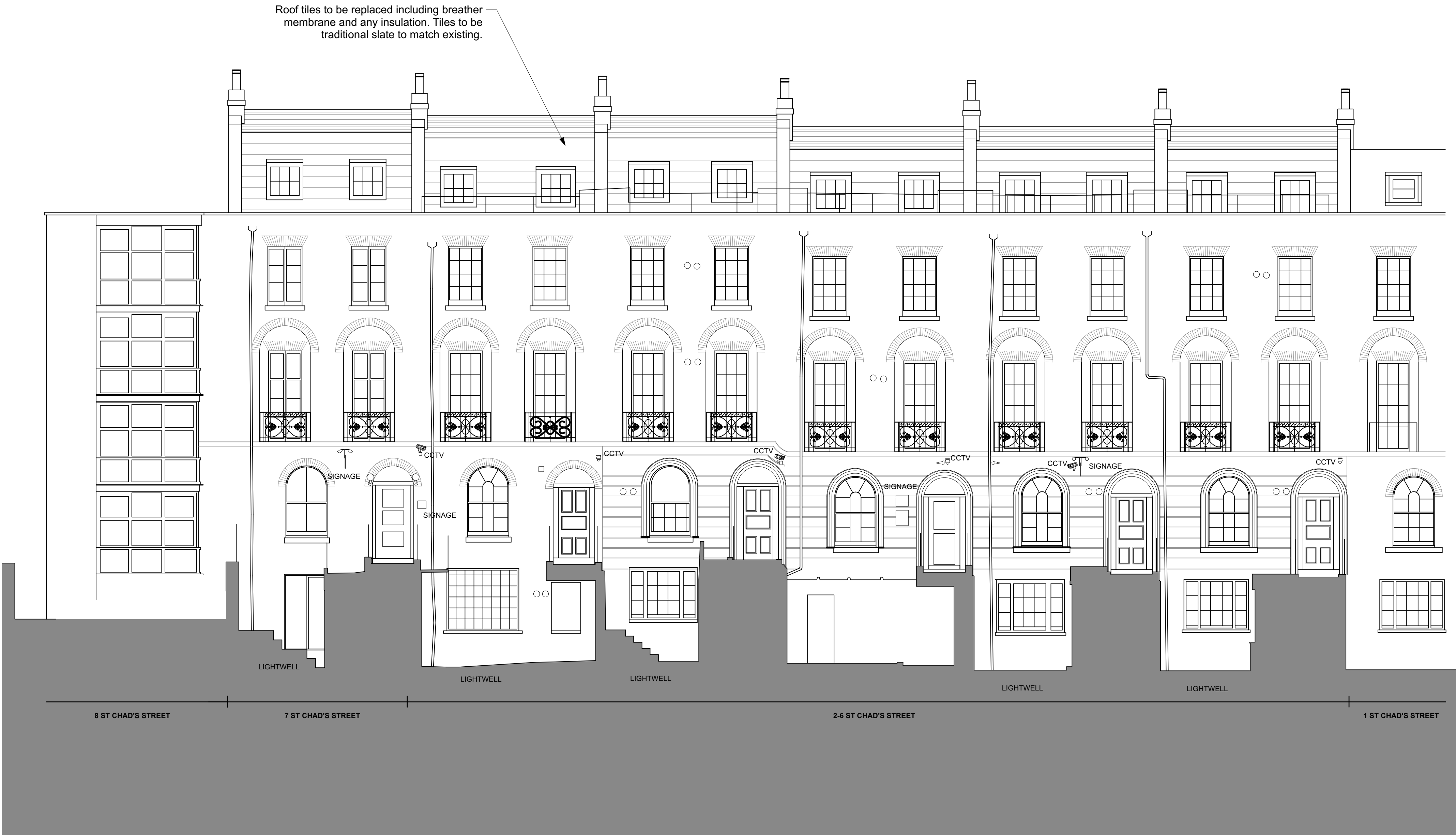
1 Proposed Front Elevation Scale: 1:75