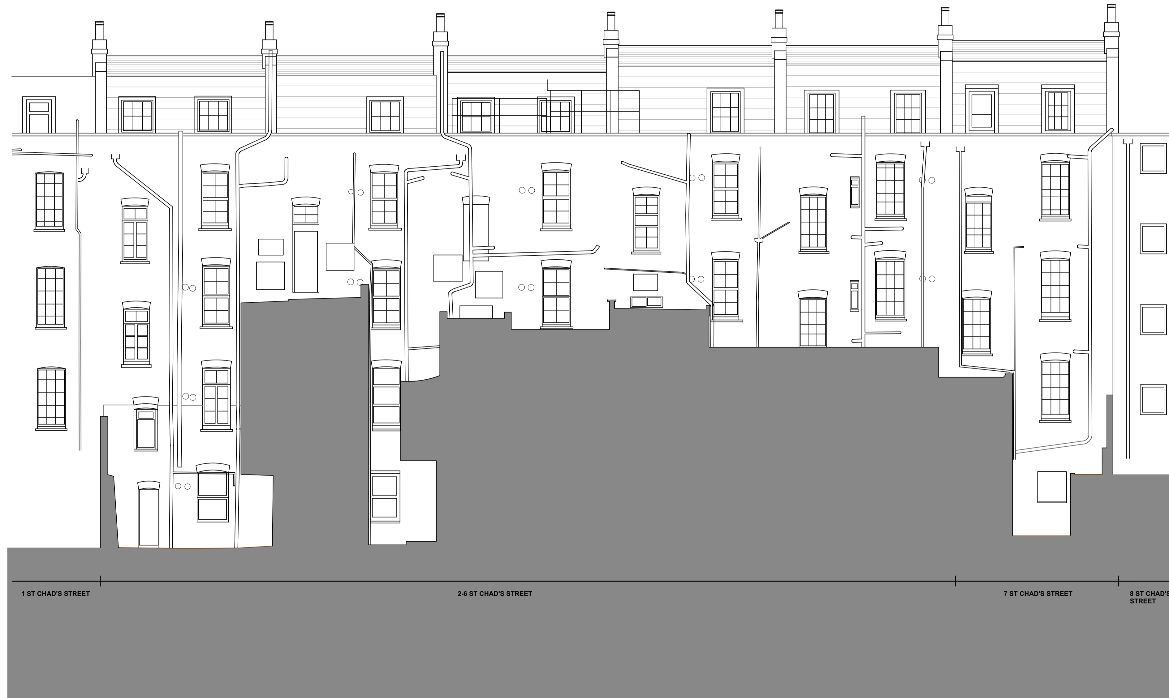
1 Existing Rear Elevation Scale: 1:75

This drawing is the copyright of Axiom Architects. The contractor is to check all site dimensions and levels before work starts. This drawing must be read with and checked against all structural and other specialist drawings, specification and bills of quantities. Notify architect of any discrepancies. The contractor is to comply with all current British Standards and Building Regulations whether or not specifically stated on these drawings. Do not scale from drawings.