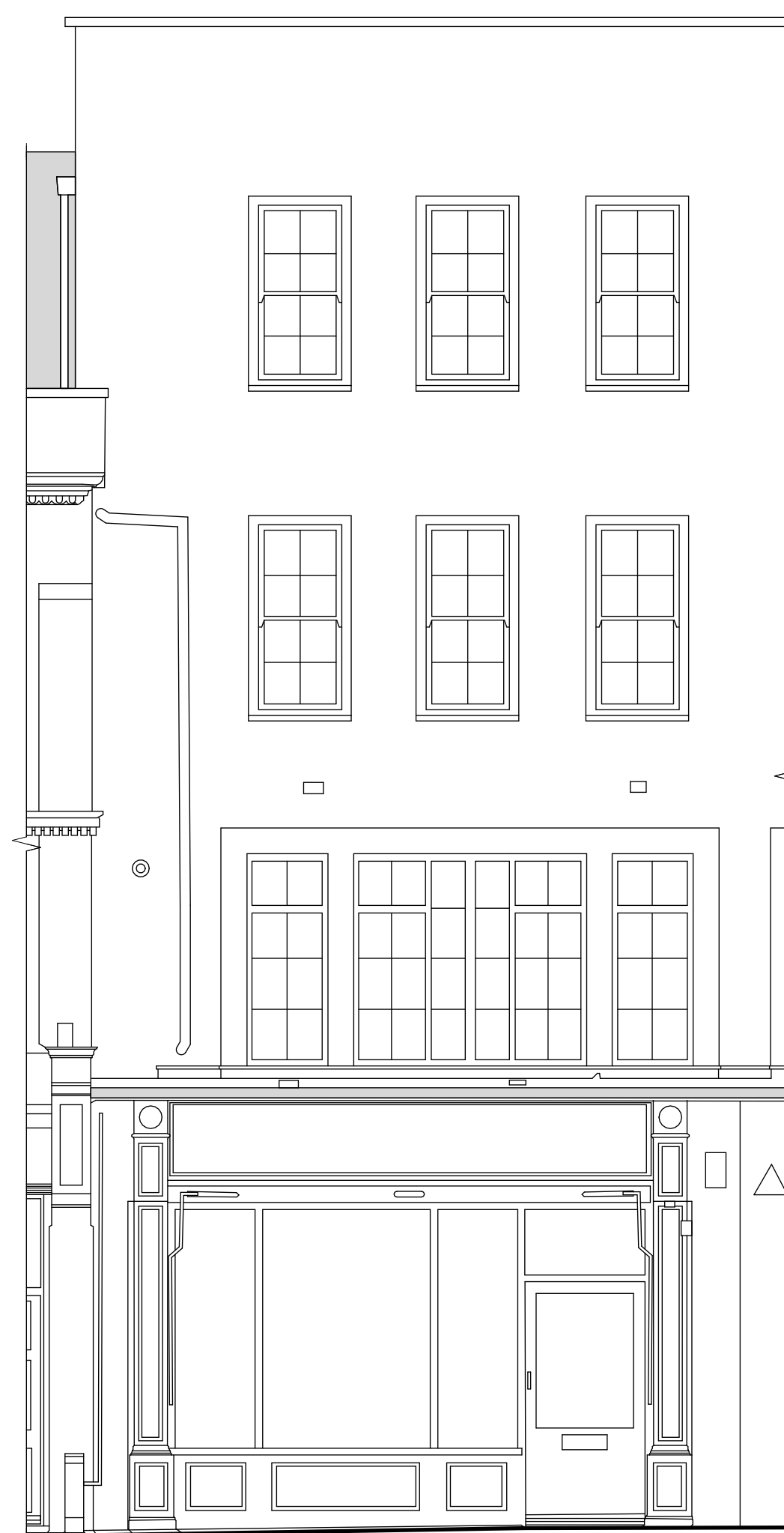
1 Existing Front Elevation 1 : 50