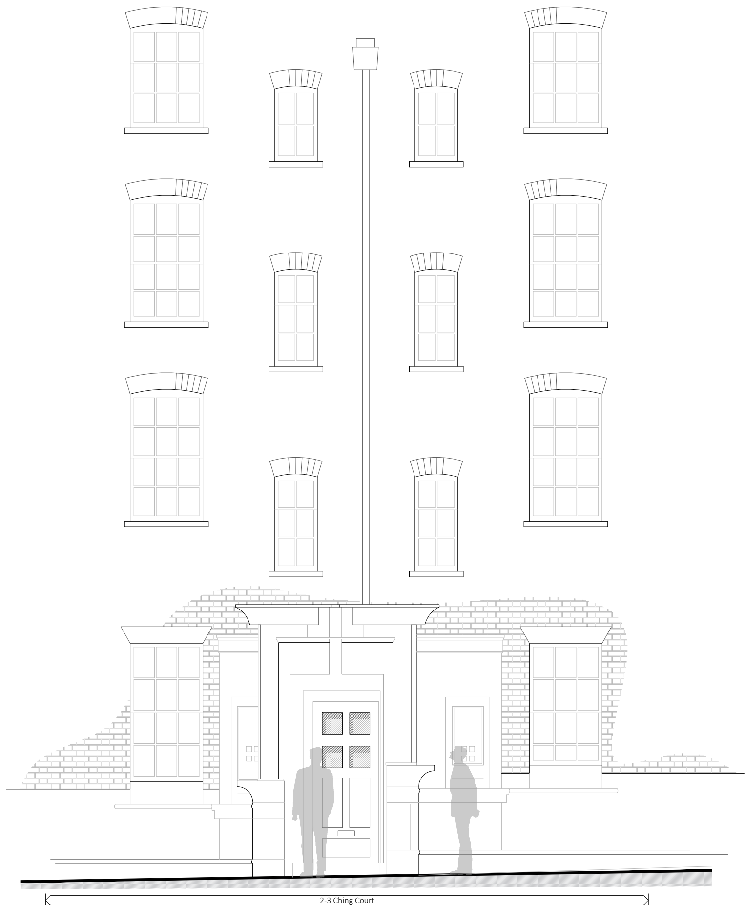
Ching Court Elevation

Disclaimer and Notes Do not scale this drawing. All dimensions should be checked on site. Any discrepancy found between this drawing, site and any other document should be referred immediately to Fresson and Tee. All drawings should be read in conjunction with all other contract documents and specifications and all other consultants drawings. Copying or reproduction of this drawing without the written permission of Fresson and Tee is not permitted. Copyright is Reserved. The PDF hard copy accompanying the CAD data is legal transmission of information. The electronic copies are issued only for convenience of use and record of original file. No liability for the accuracy or for any consequence resulting from the use, additions or alteration of information is accepted by Fresson and Tee. Title plan at 1:250 and North point is up