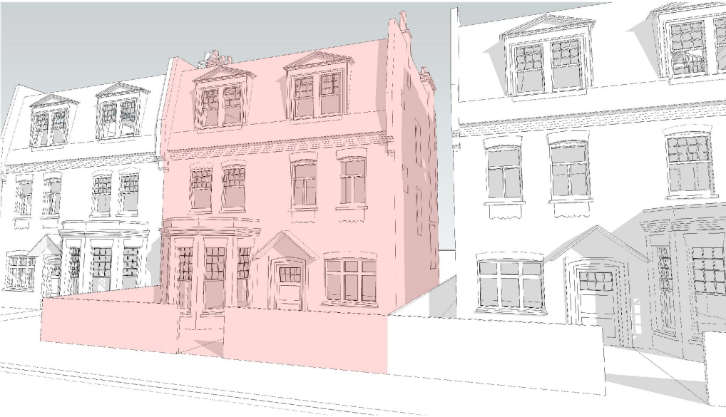
3D STUDIES SHOWING VIEWS OF PROPOSED FRONT AND SIDE ELEVATIONS FROM ABERDARE GARDENS