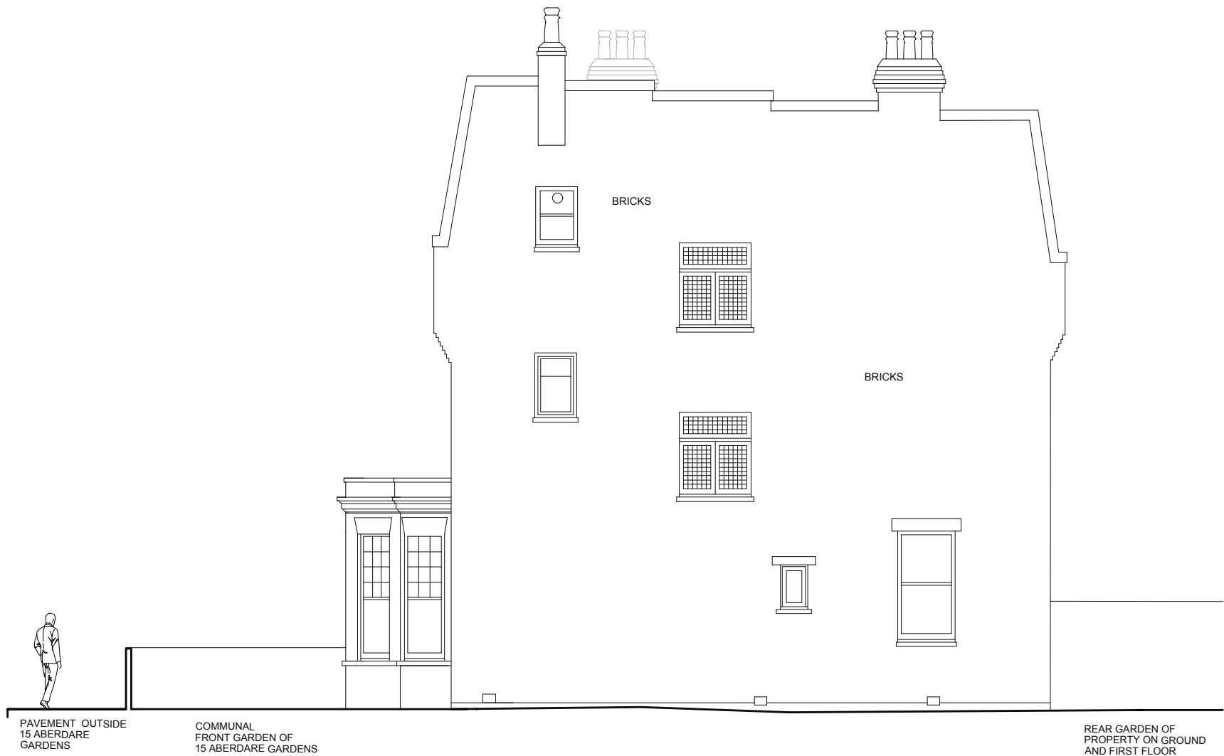
01 EXISTING SIDE ELEVATION 00B-03 SCALE 1:100