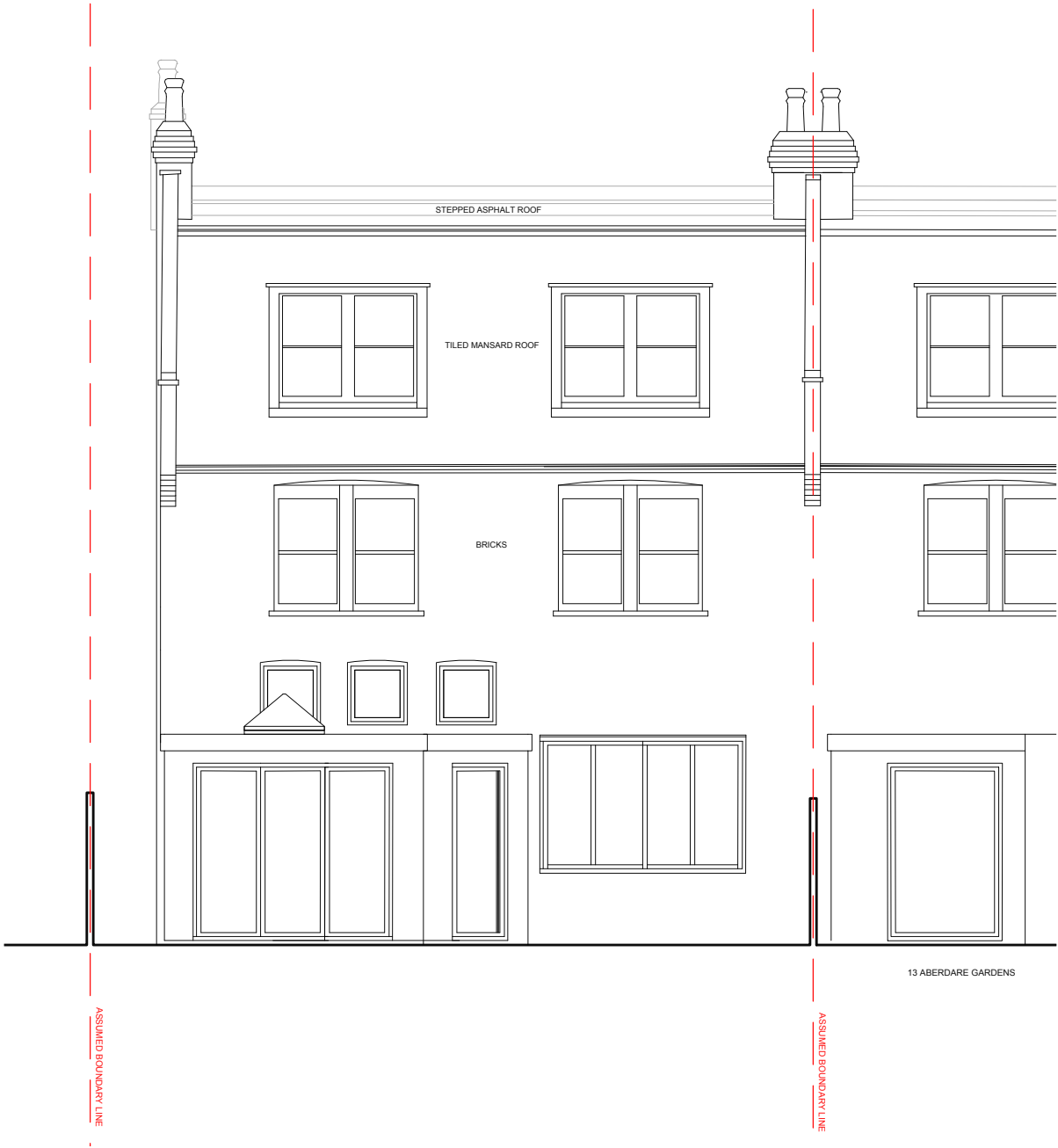
01 EXISTING REAR ELEVATION 00B-02 SCALE 1:100