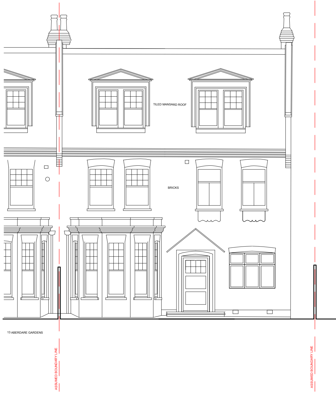
01 EXISTING FRONT ELEVATION 00B-01 SCALE 1:100