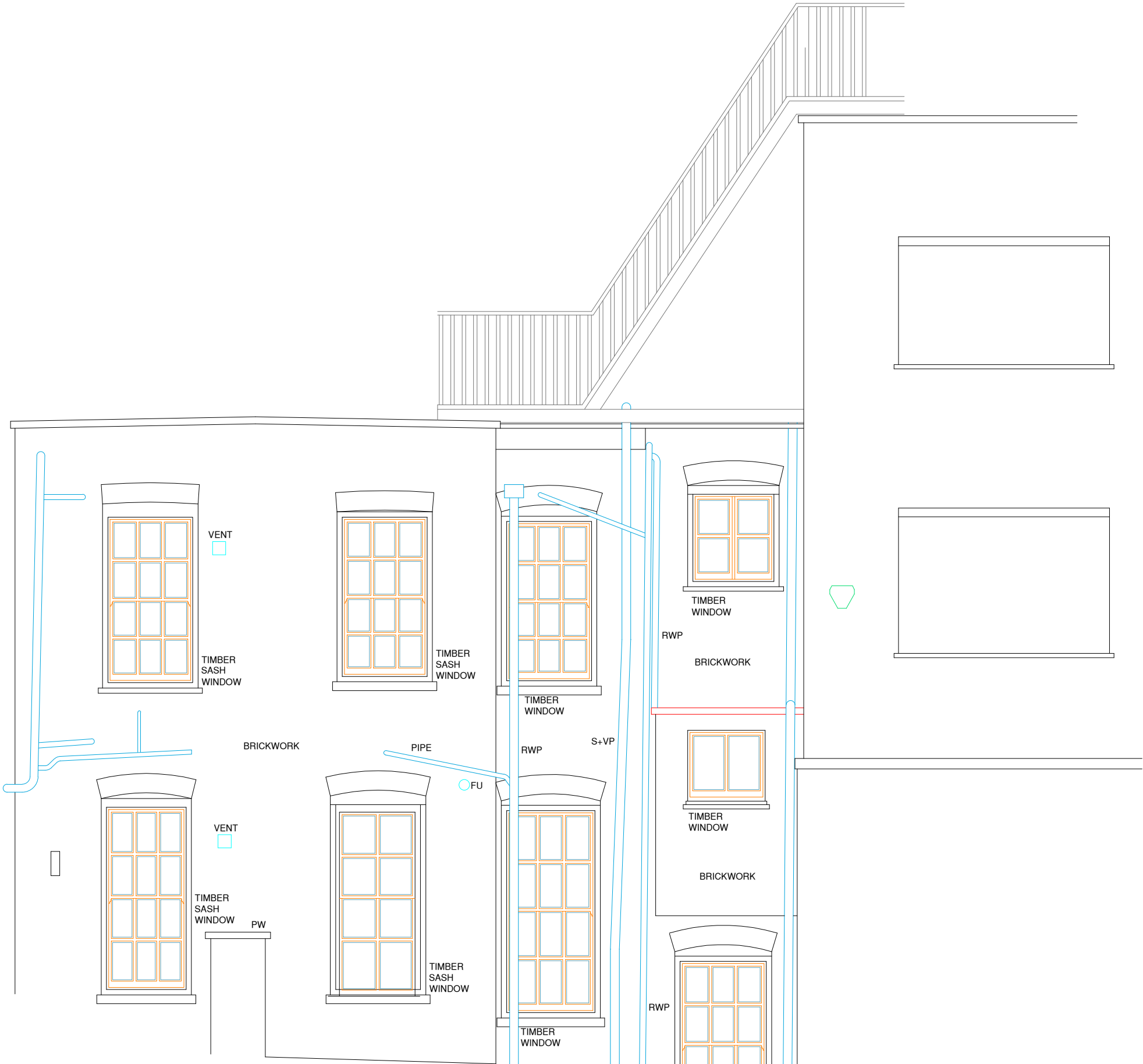
REAR ELEVATION 02